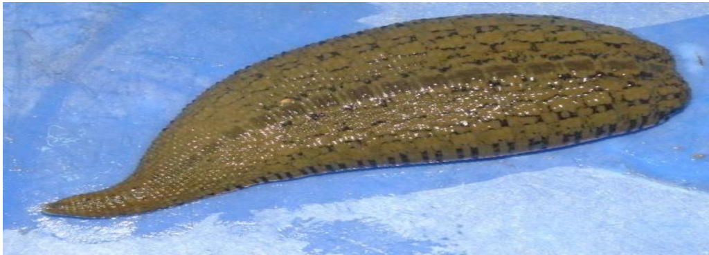
Figure 1: Body of Local Leech (Age: Two Years and Three Months)

Leeches is a sanguivorous (haemopagic), freshwater leech, with a wide distribution in Southeast Asia such as in southern China, the Philippines, Thailand, Vietnam, and Malaysia. In Malaysia, these leeches are known as 'Lintah Kerbau' (406 th Medical Lab. Special Repor, 1968). There has been numerous collection of this species for medical purposes in the 20 th century (Steiner et al. 1990; Electricwala et al. 1993; Singhal & Davies 1996). The Department of Wildlife Protection and National Parks (PERHILITAN) previously operated the leech industry in Malaysia. Since 22 nd of January 2009, the Department of Fisheries Malaysia has taken over the operation of local leech's industry (Department of Fisheries Malaysia 2009). The Fisheries Department have since identified the leech species that can be used for commercial purposes. The taxonomic status of the local leech is as follows: Order: Hirudinea; Species: Hirudinaria manillensis ; Local name: Buffalo leech or "lintah kerbau" (Figure 1).