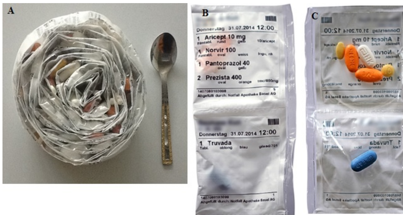
Figure 1: Unit-of-dose pouches with prepacked oral solid medication as roll (A), two pouches from front-side (B) and back-side (C). Note: patient’s name and date of birth were concealed for privacy reasons.

Solid oral prescription medications are repacked into unit-of-dose pouches (Automatic Tablet Dispensing and Packaging System, Desk Type JV-30DE, HD-Medi, Germany). Each pouch is imprinted with the patient’s data (name, date of birth) and medication data (number, name, date and time for intake, color, shape of the medication; Figure 1).