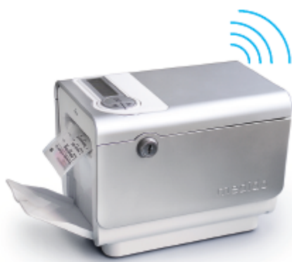
Figure 2: Remote-controlled, electronic medication management aid, medido ® , used in this study to dispense the unit-of-dose pouches (Height × Width × Length: 140 mm × 140 mm × 225 mm; Weight: 1.48 g).

A web-based application allows to set the time of dispense individually according to participants' preferences. Pushing the OK-button stops the alarm and delivers the pouches with the pre-packaged medication. A sensor in the dispenser registers a barcode printed on the top of each pouch and cuts the pouches accordingly. Date and time of delivery are simultaneously transmitted to a secure server with GPRS-technology. Doses can be delivered ahead of schedule (so-called pocket-doses) by pushing the OK-button for 5 seconds. This feature enables patient mobility i.e., to be outside of home during intake times. The dispenser is installed at the patient' home and patient is orally instructed about its proper use. A written manual is given including a telephone hotline number in case of technical problems with the dispenser. A former qualitative analysis of the dispenser suggested that patients with time-sensitive medication regimens could benefit best [14]. Further, a similar type of electronic dispenser has been considered safe to provide OAT [15].