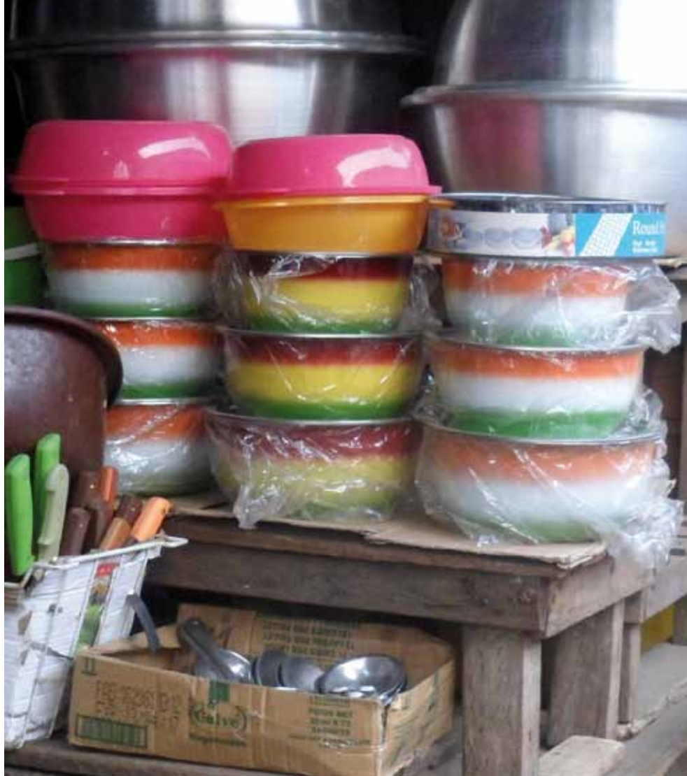
Kitchen tools painted with the colours of the Ivorian and Malian flag in the main market of Bouaké.