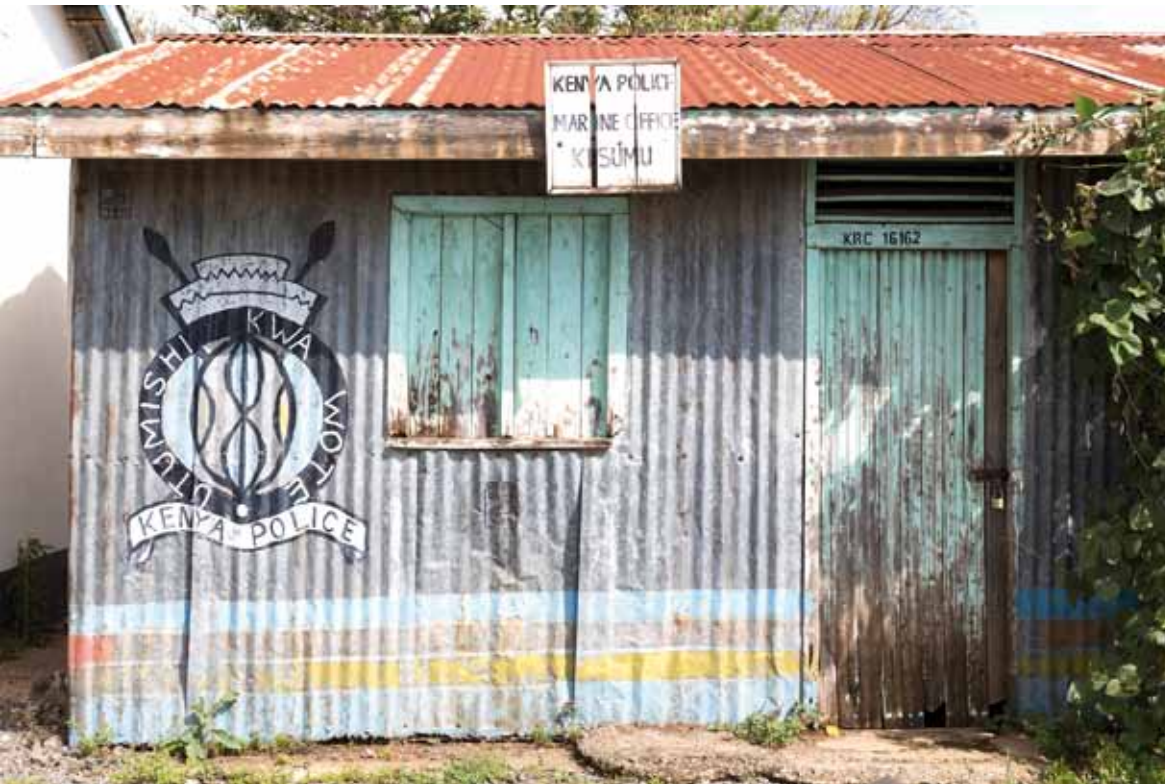
The Marine Office of the Kenyan Police in the almost abandoned harbour of Kisumu, Kenya. T. Förster, February 2017

The third level of comparison is between cities in different countries. Is it useful and meaningful to lump cities of one country into a different bracket than cities of another? Or cities that function as agricultural centres into a different bracket than administrative centres? Or cities that have experienced more vicious levels of violent conflict with each other, as opposed to cities which experienced a lesser degree of violence? Again, neither the questions nor the answers lend themselves to a response a priori . Lines of comparative enquiry open up with the findings on a more local level, and may indeed be surprising. Patterns and regimes of urban political articulations may become visible among unlikely suspects, or rather among unlikely aspects. Or again, it may become clear that the emergence of seeming similarities across cities may be due to fundamentally different processes (for a critical discussion, see Förster, this issue). In this sense, and across and between all levels of comparison, we join a growing choir of scholars calling for a more explorative and less pre-determined, normative approach to urban comparison.