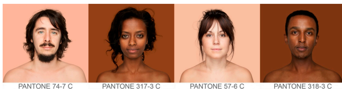
Figure 2. Final photographs choice.

Although the above mentioned criteria, the relation between the photos and the children unavoidably put a strain on the apparently “criteria objectivity” because the perception is always a subjective question (Mulaik, 1995 [40]; Crary, 1999 [41]). As Merleau-Ponty (1996) [42] highlighted: