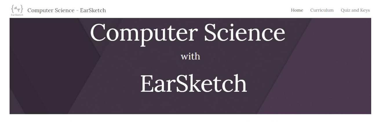
This webpage is developed for high school computer science teachers to use while teaching students to code with music through EarSketch. In this webpage you will find a curriculum page that will outline a unit and provide supplemental section reviews, projects, quizzes, and rubrics for Unit 1 and looping (in Unit 2) for the EarSketch program. This unit is designed to be in addition to another computer science curriculum.

The way I designed the unit is how I would teach it to my computer science classes. I would cover most of unit one on the fundamentals and loops from unit two. This will give a good overview on how EarSketch works and it gives a foundation on creating music through code. The material that I created with an overview of the unit was developed and then put on a google site for other computer science teachers to access. The first page of the site is a description of the purpose of the sight and how I think it should be used, as shown in figure 1. Then the next page is the overview with links to all of the content I created. This overview page contains an outline to flows from top to bottom of the page, as shown in figure 2. The first task is for students to set up an EarSketch account and next is a day one PowerPoint with an overview of the EarSketch components as well as basic coding vocabulary that will be used throughout the unit, as shown in figure 3.