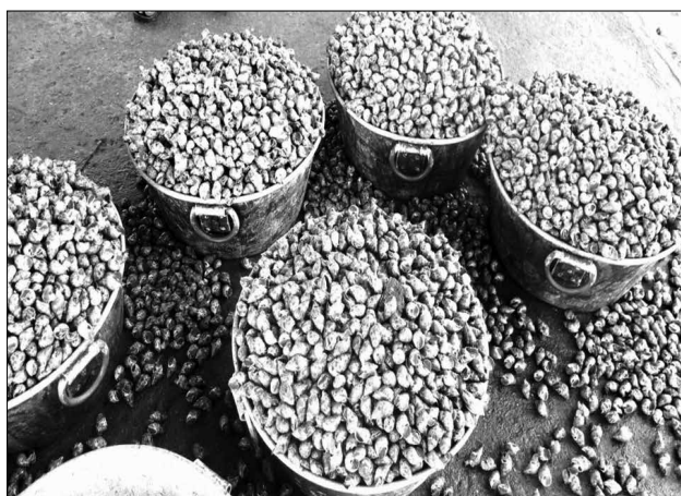
Fig.3. Gastropods set ready to get weighed

being carried for weighing at the landing centre and set ready for weighing, respectively.