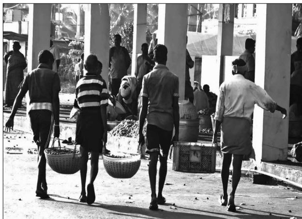
Fig.2. Gastropods carried to the weighing centre

centres. The gastropod landings are obtained by the exporting companies from the landing centre itself and the species are separated and weighed onsite. The gastropods are taken to the nearby exporting companies where they are cleaned and processed. No middlemen work in between the fishermen and the exporting companies. Fig. 2 and 3 depict the gastropods