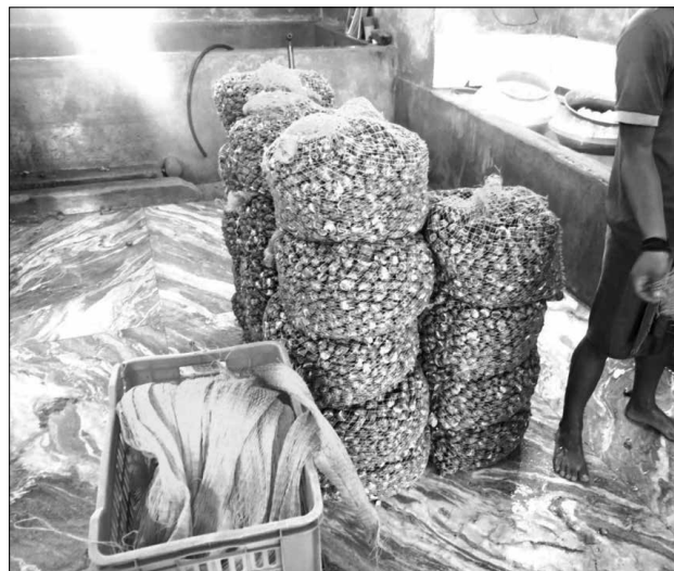
Fig. 4. Gastropods washed and packed at an exporting company of Kollam

the whole gastropod either frozen or alive. The B. zeylanica , which is landed in huge quantities in the Kollam harbours are the main frozen gastropod and are exported at an average rate