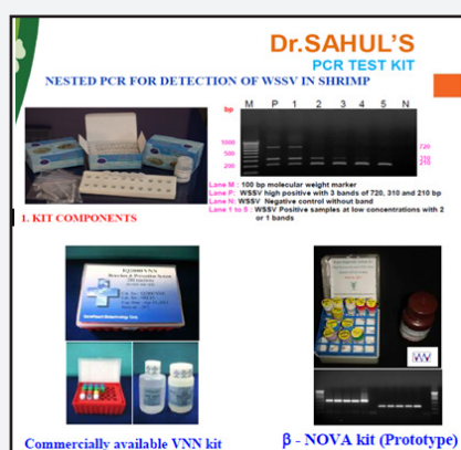
Figure 1: Indigenous diagnostic kits developed for white spot syndrome virus of shrimp and fish Nodavirus.

For the protection of cultivable organisms from viral and bacterial pathogens immunostimulants of bacterial or plant origin of different types have been developed. Laboratory studies indicate that administration of a commercial Aquastim MBL by immersion or through feed stimulates the immune system of shrimp in hatchery, showing significant improvement in survival. Immuzone derived from a group of terrestrial plants through extraction process is used commercially as herbal immunostimulant. The defensive mechanism of shrimps and other crustaceans improved by a group of compounds through the synergic effect. It does not contain Glucans and Mannans. Immuzone increases the defensive mechanism of shrimp by enhancing the hemocytic activities. Higher levels of prophenol oxidase and nitric oxide were observed after ingestion of immuzone coated feed in pond reared shrimp.