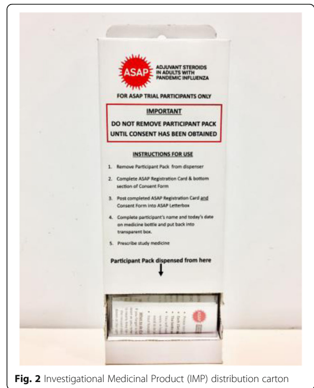
Fig. 2 Investigational Medicinal Product (IMP) distribution carton

This activation exercise confirmed that the ASAP trial is in a state of readiness and can be ‘aroused’ from its current hibernation phase to active recruitment within