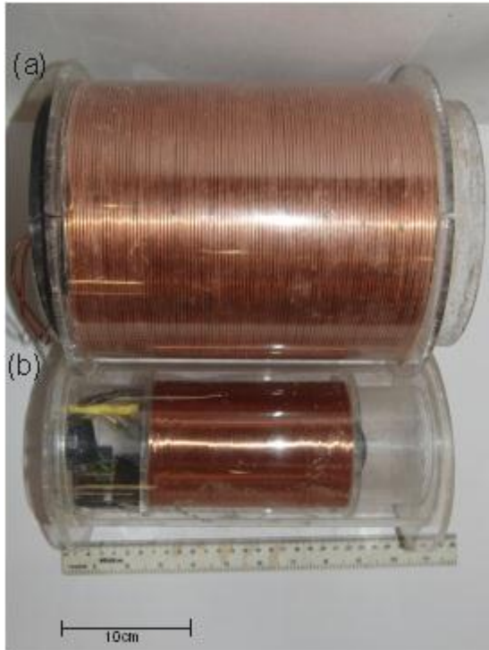
Fig. 1: The Earth's field nuclear magnetic resonance probe. (a) Polarising coil. (b) Transmit-receive coil.