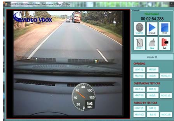
Figure-2. Extraction of traffic volume using TAS

During the traffic volume extraction, vehicles were classified as light, medium, heavy, bus, and motorcycles. These classes were coded in the TAS with five (5) distinct icons. Each class of vehicle is counted by clicking on the appropriate icon from TAS dialogue box or use of shortcut key from the computer keyboard. The five icons are provided for each of the three categories of vehicles considered during the extraction; M , O , and P corresponding to opposing, overtaking test car, and passed by test car, respectively. As the video plays and counting progresses, the software continuously displays the total number of vehicles counted and speed of the test car at any moment as shown in Figure-2.