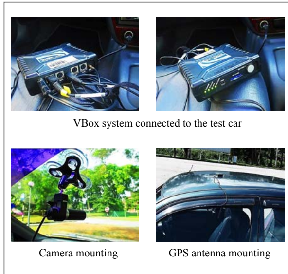
VBox system connected to the test car