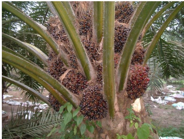
Figure 9 (a) Oil Palm after treatment by ADOPSY™, eventually increase numbers of FFB

This case study also indicates that the increase of crops by quantity will of course increase in yield. Plantation operators normally measure the quality of FFB. The quality of FFB is subjective to land area of plantation and also varies according to management point of view. Management decides on usage of any type of fertilizer, pruning intervals and so on. This case study has successful materialized the tangible finding by increasing the quantity of fresh fruit bunch. The increased in terms of the numbers of fresh fruit bunch produced by the plant after the ADOPSY treatment, are also depicted by sample of plant in Figure 9(a) and Figure 9 (b).