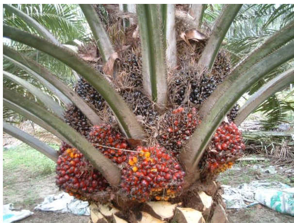
Figure 9 (b) ADOPSY™ is mean artificially increase pollination activity