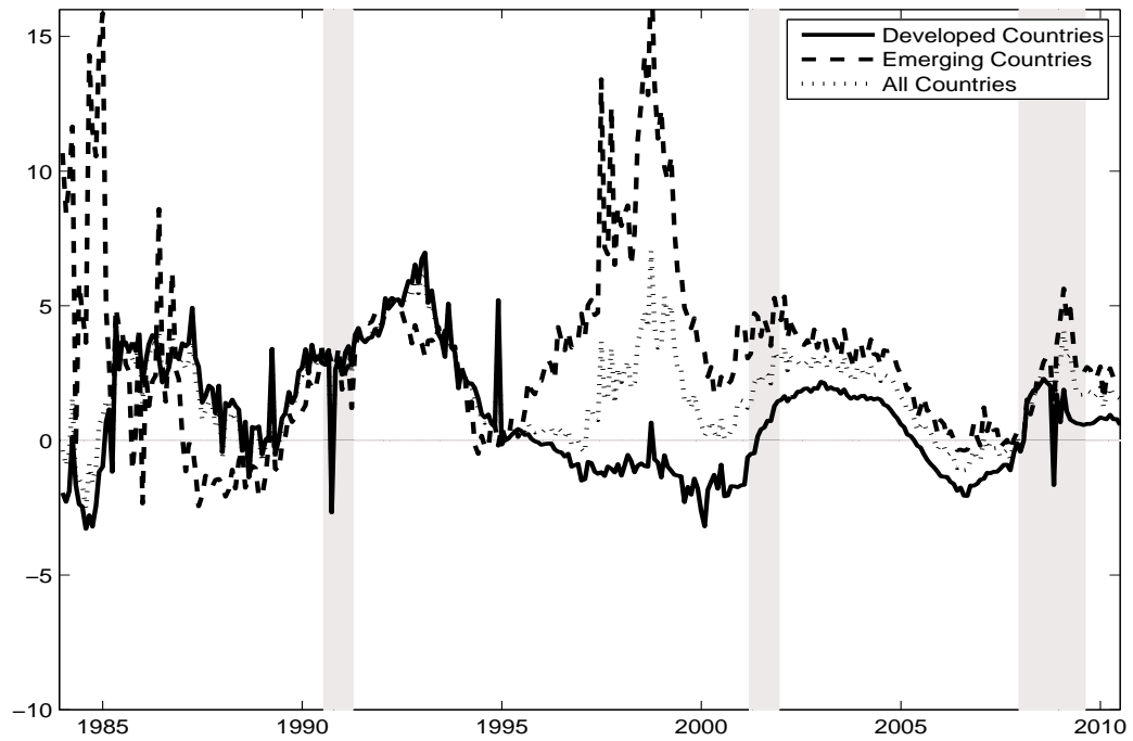
Figure 1: Average 12-month Forward Discounts on Three Currency Baskets

This figure presents the average 12-month forward discounts on three currency baskets (developing countries, developed countries, and all countries). The shaded areas are U.S. recessions according to NBER. The sample period is 11/1983–6/2010.