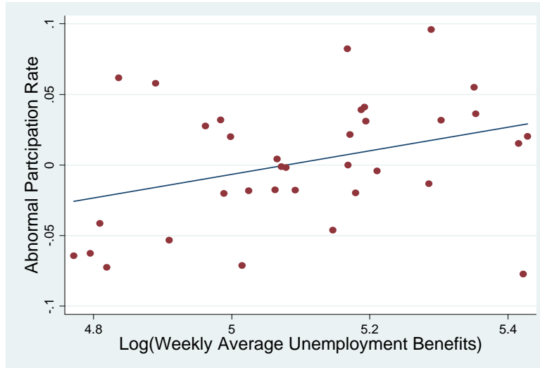
Figure 3: Participation and Unemployment Insurance

This figure plots the univariate scatter plot of abnormal stock market participation rates across U.S. states and generosity of unemployment insurance in 1992. Abnormal participation rates are the state-level residuals from a household-level regression of a stock market participation indicator onto household characteristics. These residuals were obtained from Hong, Kubik, and Stein (2004). Unemployment insurance generosity is captured using log(average amount of weekly unemployment benefits paid to individuals in a state), as reported by the U.S. Department of Labor. These weekly benefit averages were obtained from Chetty (2008).