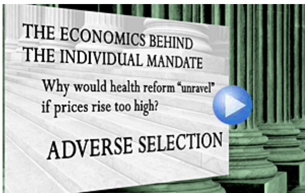
Slide Presentation: Click to view "The Economics Behind The Individual Mandate" (5 minutes)

One implication of adverse selection is that even if everyone wants insurance and is willing to pay more than their expected cost of medical care to obtain it, the market will not ensure that everyone is able to purchase insurance. Consequently,