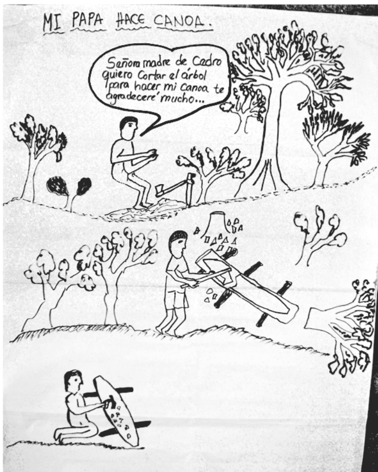
Figure 2. Canoe-making poster used in Pedro's Spanish class.