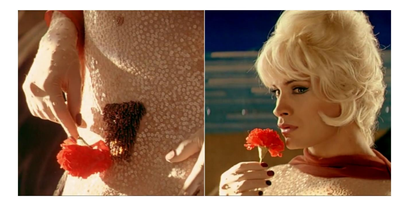
Fig. 4. Zahara as Sara Montiel

was not flowing from the inside shows the flimsiness of gender 'essence'. Ángel literally wears a woman's skin and displays gender as performance in her/his performance of Sarita Montiel's song Quizás , quizás , quizás . Furthermore, this scene also functions as a parody of masculinity. Instead of a large phallus, we see a bulging pubic area; a shimmering display of the female pubis (see fig. 4). Here it is the female skin that is proud and out, not the phallus. Almodóvar treats transgenderism as a state of 'being' and 'acting', rather than one of 'becoming'. Hence, most of his transgender characters move across the gender spectrum rather than 'coming out' as fully transitioned subjects. Almodóvar does not believe in a fixed gender dichotomy or clear-cut unchanging sexual desire. Instead, he showcases the defects of the sex/gender system through parodies, exaggerated sexual performances and making fun of so-called normativity.