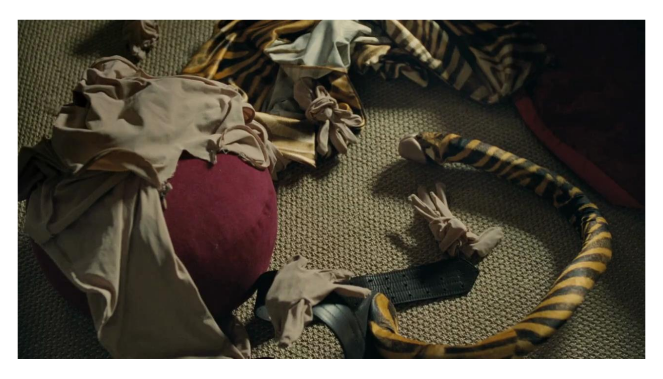
Fig. 11. Zeca's Torn Costume Tail

Although a pioneer in his questioning of gender normativity, Almodóvar nevertheless reproduces certain ancient clichés concerning women. All three women in the film also "function