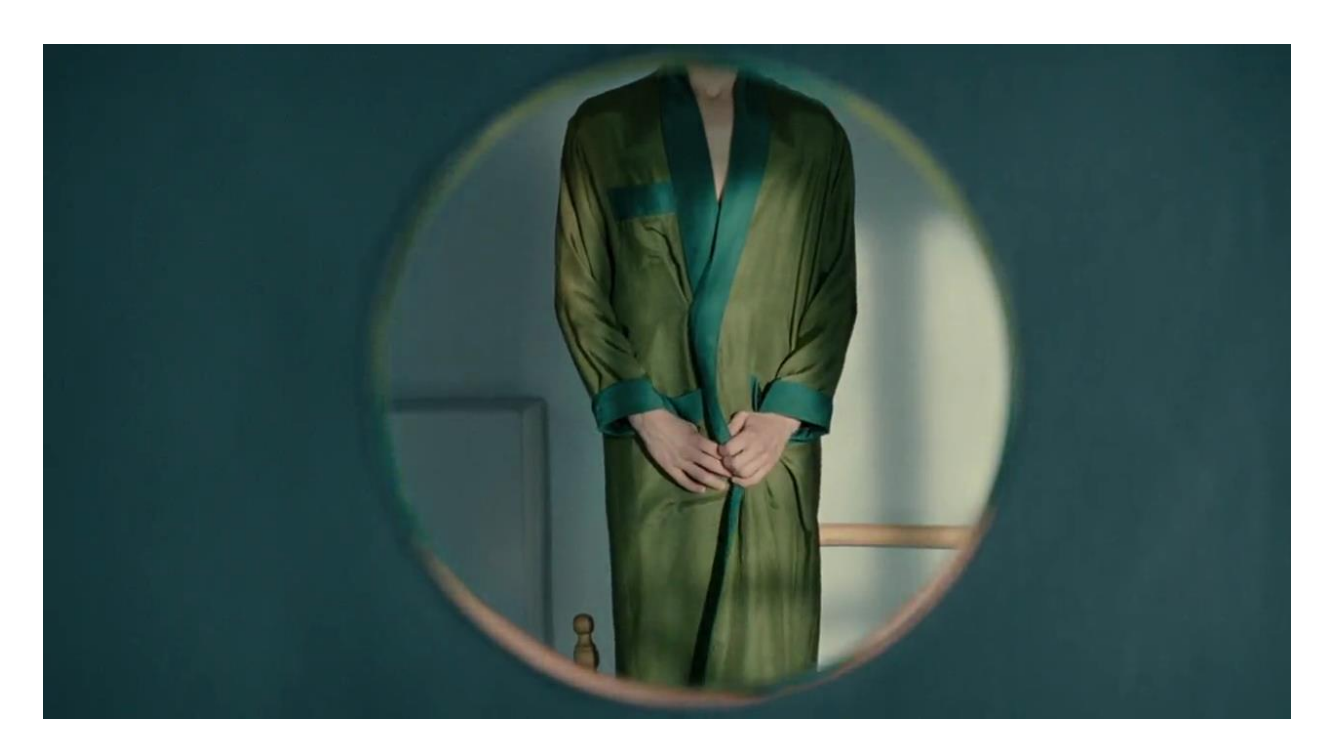
Fig. 6. Vincent/Vera After the Vaginoplasty