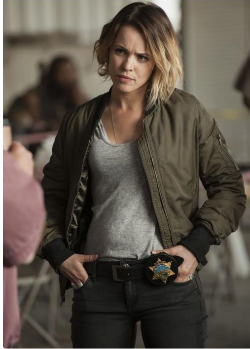
Figure 3 Ani's typical attire.