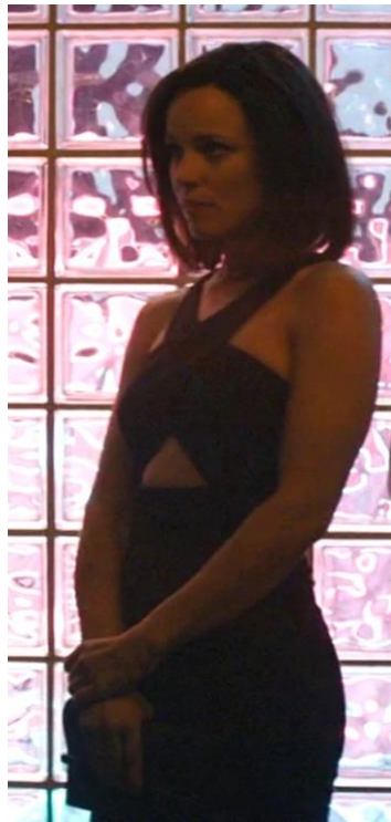
Figure 4 Ani's undercover look.