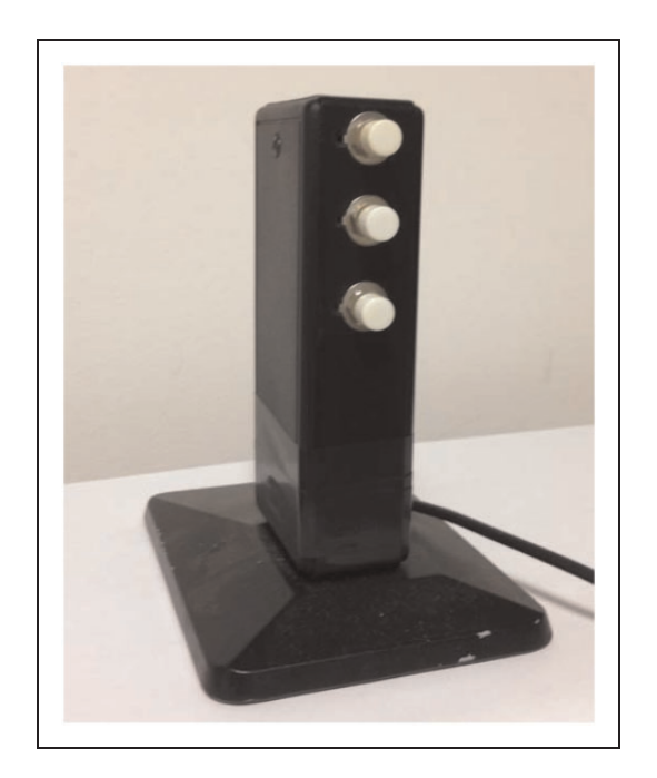
Figure 1. Photo of the custom-made response box used in the experiment.

(Moore, 2013). On each trial, participants judged whether the probe tone was louder or quieter than the reference tone, by pressing either of two keys: one key for "louder" tones and the other key for "quieter" tones. The two keys were placed on a custom-made, vertically oriented response box. The distance between the two keys was 7 cm (see Figure 1).