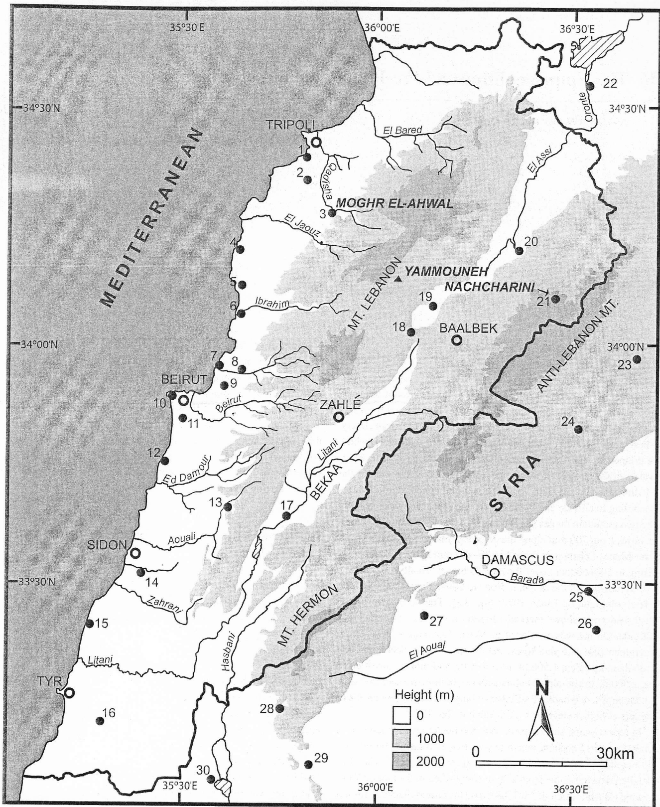
Figure 76.1 Palaeolithic and Neolithic sites in Lebanon and adjacent areas. 1 – Abu Halka (Upper Palaeolithic); 2 – Keoué (Middle Palaeolithic); 3 – Moghr el-Ahwat (Middle and Epipalaeolithic, Neolithic); 4 – Masloukh (Lower Palaeolithic); 5 – Byblos (Neolithic); 6 – Nahr Ibrahim (Middle Palaeolithic); 7 – Ras el Kelb (Middle Palaeolithic); 8 – Jiita (Epipalaeolithic); 9 – Ksar 'Akil (Middle, Upper, and Epipalaeolithic), Abri Bergy (Epipalaeolithic), Antelias (Upper and Epipalaeolithic); 10 – Ras Beirut (Lower and Middle Palaeolithic); 11 – Borj Barajne (Epipalaeolithic, Neolithic); Tell aux Haches (Neolithic); Tell aux Scies (Neolithic); 12 – Naamé (Middle Palaeolithic); 13 – Mouktara (Neolithic); 14 – Borj Qinnarit (Lower Palaeolithic); 15 – Bezez (Lower, Middle, and Upper Palaeolithic, Neolithic), Abri Zumoffen (Lower Palaeolithic); 16 – Qana (Middle Palaeolithic); 17 – Joub Jannine (Lower Palaeolithic); 18 – Saaidé (Epipalaeolithic, Neolithic); 19 – Tell Ard Tlaili (Neolithic); 20 – Tell Labwe (Neolithic); 21 – Nachcharini (Epipalaeolithic, Neolithic); 22 – Tell Nebe Mend (Neolithic); 23 – Yabrud (Lower, Middle, Upper, and Epipalaeolithic); 24 – Baaz (Epipalaeolithic, Neolithic); 25 – Ghoraifé (Neolithic); 26 – Tell Aswad (Neolithic); 27 – Tell Ramad (Neolithic); 28 – Berekhat Ram (Lower Palaeolithic); 29 – Quneitra (Middle Palaeolithic); 30 – Ain Mallaha (Epipalaeolithic), Beisamoun (Neolithic).