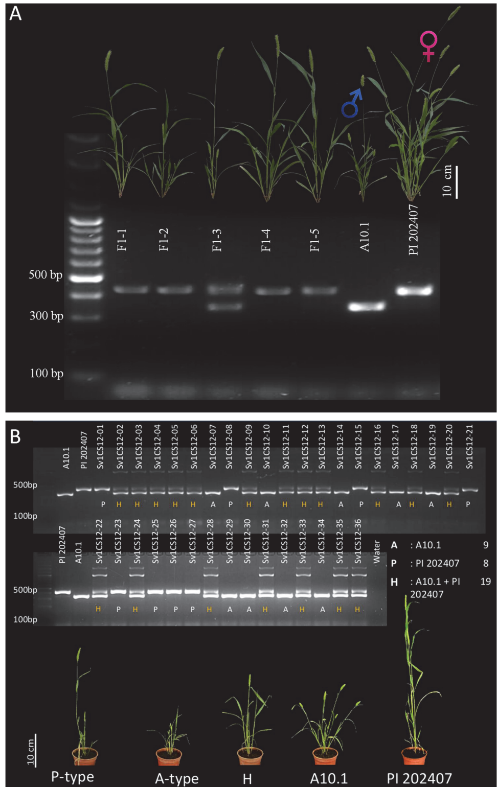
Fig 6. PCR verification of the crossed progenies using SSR markers. (A) Products of PCR using an SSR marker on F 1 plants and the two parents (A10.1 and P1 202407). (B) PCR using the same SSR primer pair on the F 2 plants obtained from self pollination of the F 1 (F 1 -3, shown in Fig 6A), and phenotypes of the representative plants of parents A10.1 (A) and PI 202407 (P). Plants from F 2 generation were labeled A-type, P-type and H-type (heterozygous having both A-type and P-type alleles) plants.