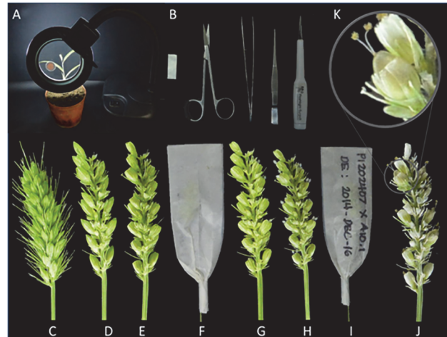
Fig 2. Manual emasculation of Setaria viridis . Equipment needed for manual emasculation included (A) a magnifying glass, (B) glassine bag, scissors, forceps and ear pick. (C) A panicle of correct developmental stage, when the lowest spikelet of the panicle was between 0 to 2 cm from the collar of the flag leaf, was selected for emasculation. (D) The spikelets from the tip and base of the panicle were trimmed leaving approximately 10 to 20 spikelets, and then their bristles were trimmed. (E) One third of each spikelet was removed using sharp scissors and then all three anthers from each spikelet of the panicle were removed using an ear pick and/or forceps. (F) The emasculated panicles were enclosed in glassine bags. (G) On the following day, the spikelets were checked and were dusted with pollen. (H) The pollination was repeated for two days. (I) The emasculated and pollinated panicles were then bagged until seed set. (J) Seed set was checked 10 to 12 days after pollination, if immature seed germination was required. (K) The seeds were allowed to mature and were harvested with care to avoid shattering.