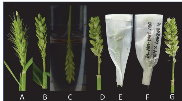
Fig 1. Emasculation of Setaria viridis . (A) Panicles that had just emerged completely out of the flag leaf sheath, such that the lowest spikelets of the panicles were between 0 and 2 cm from the collar of the flag leaf were selected. (B) The spikelets from tip and base of the panicle were trimmed; leaving approximately 50 florets and the bristles were also trimmed. (C) The panicles were completely immersed in the MH solution for 2 min, and excess liquid was gently wiped using tissue paper and (D) then the plant was left to stand until the panicles were dry. (E) After wiping off the solution and drying, the panicles were placed in glassine bags of appropriate sizes. (F) The glassine bag was labeled with the plant designation and emasculation date. Steps D and E were repeated on the same panicle for three consecutive mornings. (G) Panicle, 10 days after pollination.

For manual emasculation, magnifying lens, ear pick, scissors, and forceps were used (Fig 2A and 2B). The pointed end of the ear pick was rubbed with fine sand paper to make it sharp (Fig 2B). Spikelets which had emerged out of the leaf sheath were used for manual emasculation (Fig 2C). A number of spikelets, as per the need and efficiency of the scientist, were selected for hand emasculation and other spikelets were removed (Fig 2D). The top one third of each spikelet was cut off using sharp scissors (Fig 2E). Using the sharpened tip of the ear pick, three