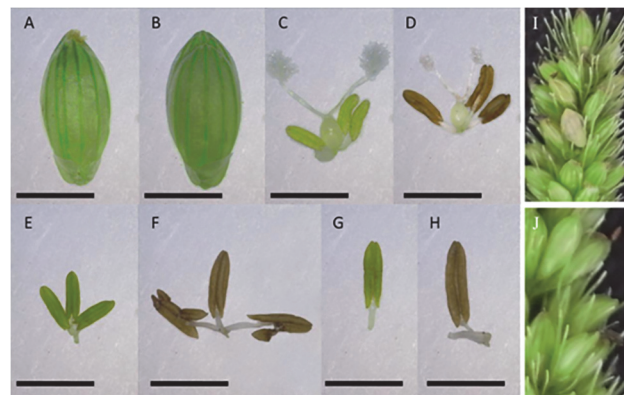
Fig 5. The effect of maleic hydrazide (MH) on the pre-anthesis anthers of Setaria . (A) Untreated control spikelet and (B) spikelet treated with 500 \mu\text{M} MH. (C and D) Androecium and gynoecium of control and MH-treated spikelets, respectively. (E and F) Anthers of control and MH-treated spikelets, respectively. (G and H) A representative anther of control and MH-treated spikelets, respectively. (I) In control panicles, mature seeds were observed in the spikelets. (J) Brown specks were observed as remnants of anther dehiscence in the MH-treated panicles and no seeds were set although the florets remained green. The scale bar represents 5 mm in A and B, 0.5 mm in C, D, E and F, and 0.75 mm in G and H; I and J are not to scale.

Dipping of panicles in 500 \mu\text{M} MH solution for 2 min a day for 3 consecutive days caused agglutination of anthers. The stigmas were still white and receptive (Fig 5D). We observed 3% self-pollinated seeds in the emasculated stigmas and the seed set increased to 22% after pollination, confirming the efficiency of the MH in suppressing the pollen viability without adversely affecting the receptivity of the stigma (Table 1 and Fig 5).