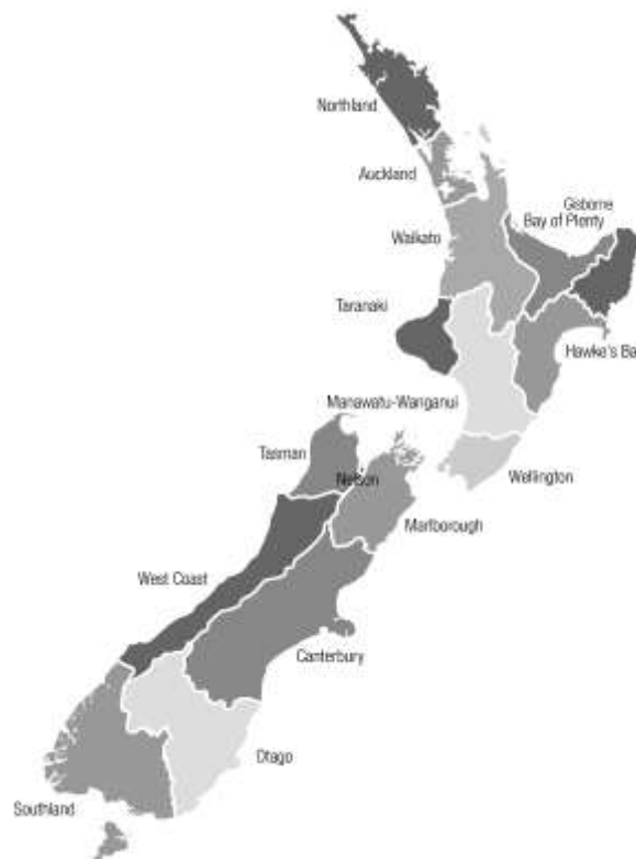
Figure 4. New Zealand regional councils

Management of freshwater in New Zealand's rivers, lakes and aquifers is governed under its 1991 Resource Management Act (RMA) the purpose of which is 'to promote the sustainable management of natural and physical resources'. New Zealand has one of the most devolved water governance regimes in the world (Fenemor et al., 2006) and one of the first to give legal recognition to Indigenous rights for water, for example in the Waikato and Whanganui catchments (Ruru, 2013; Salmond, 2014). iii Sixteen regional authorities, whose boundaries mainly follow catchment boundaries (Fig. 4), are governed by locally elected councillors and have primary responsibilities including management of water allocations, water quality management, and flood management.