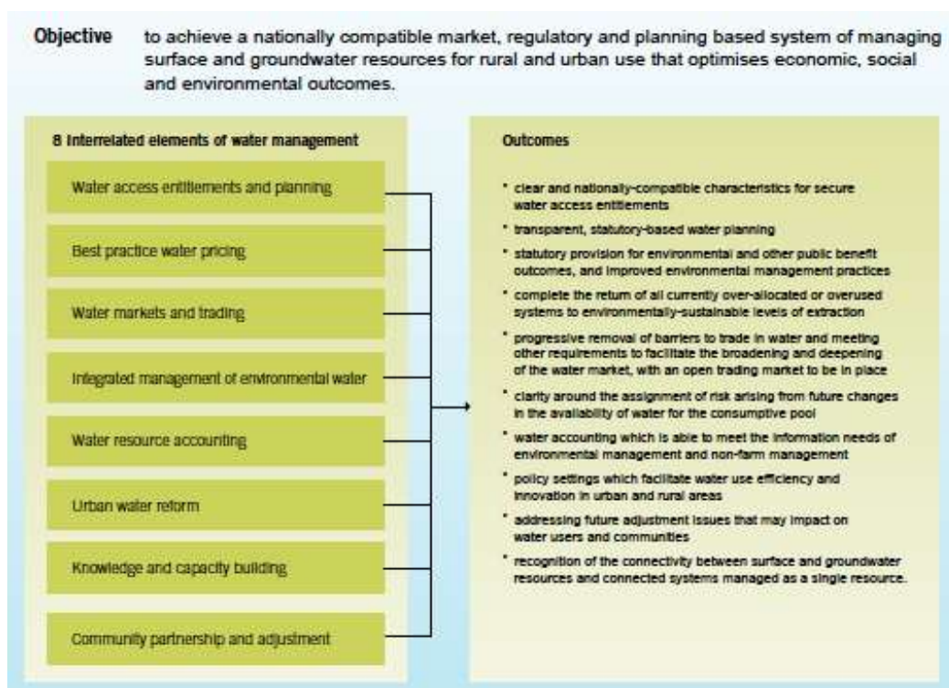
Figure 3. Objective, elements and outcomes of Australia's NWI (NWC 2014a)

Commentators such as Connell et al. (2006) argue that the NWI's primary goal is sustainable management of water, as seen in the triple bottom line statement in Fig. 3, yet most of the measures in the NWI relate to water entitlements. The establishment of nationally-compatible water access entitlements to facilitate the operation of water markets within and between jurisdictions required changes in water legislation and implementation through state-based statutory water planning processes incorporating public participation of varying degrees (Gentle and Olszak, 2007; Tan et al., 2012).