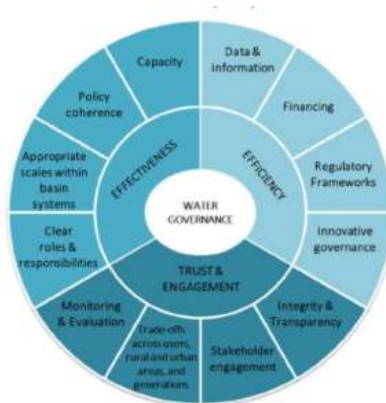
Figure 1. Overview of OECD Principles on Water Governance (OECD, 2015a)

Akmouch and Correia (2016) reviewed the work done by OECD in recent years on water governance and discussed the development and application of the ‘OECD Principles on Water Governance’ (Fig. 1). The Principles were developed by the OECD Water Governance Initiative (WGI), a multi-stakeholder platform of over 100 delegates from public, private and non-profit sectors, to support collective action to scale up governance responses to water challenges. The 12 Principles are presented in Appendix 1.