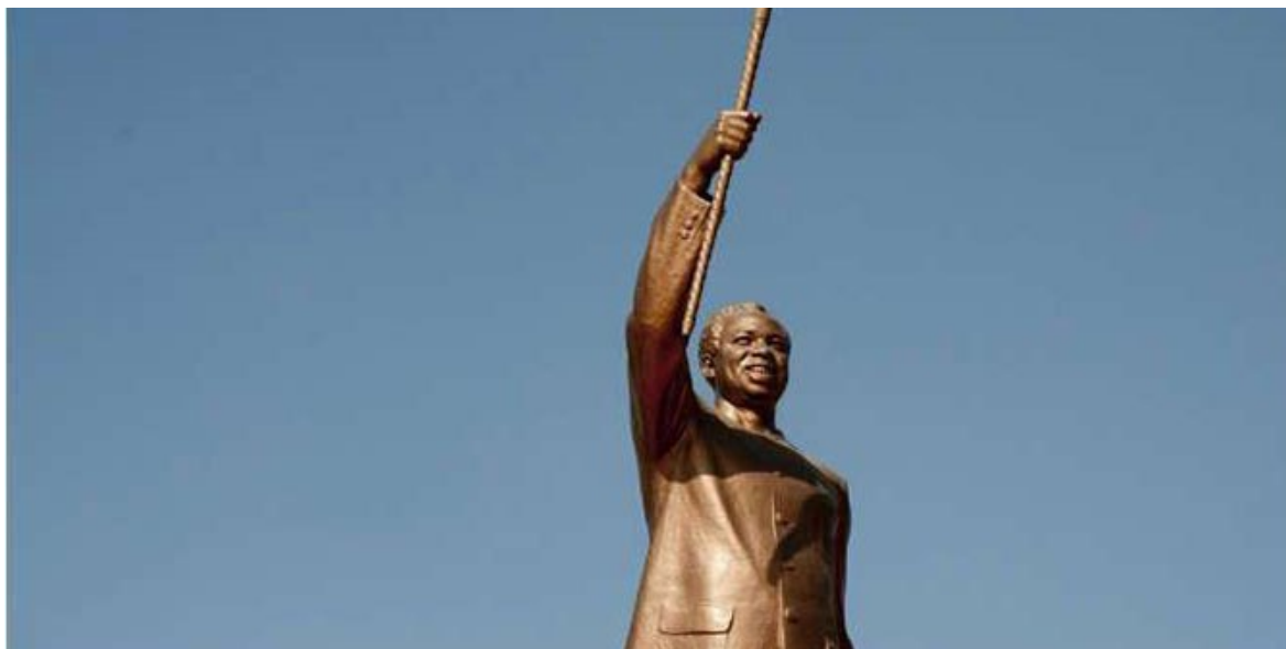
A statue of Julius Nyerere in Dodoma