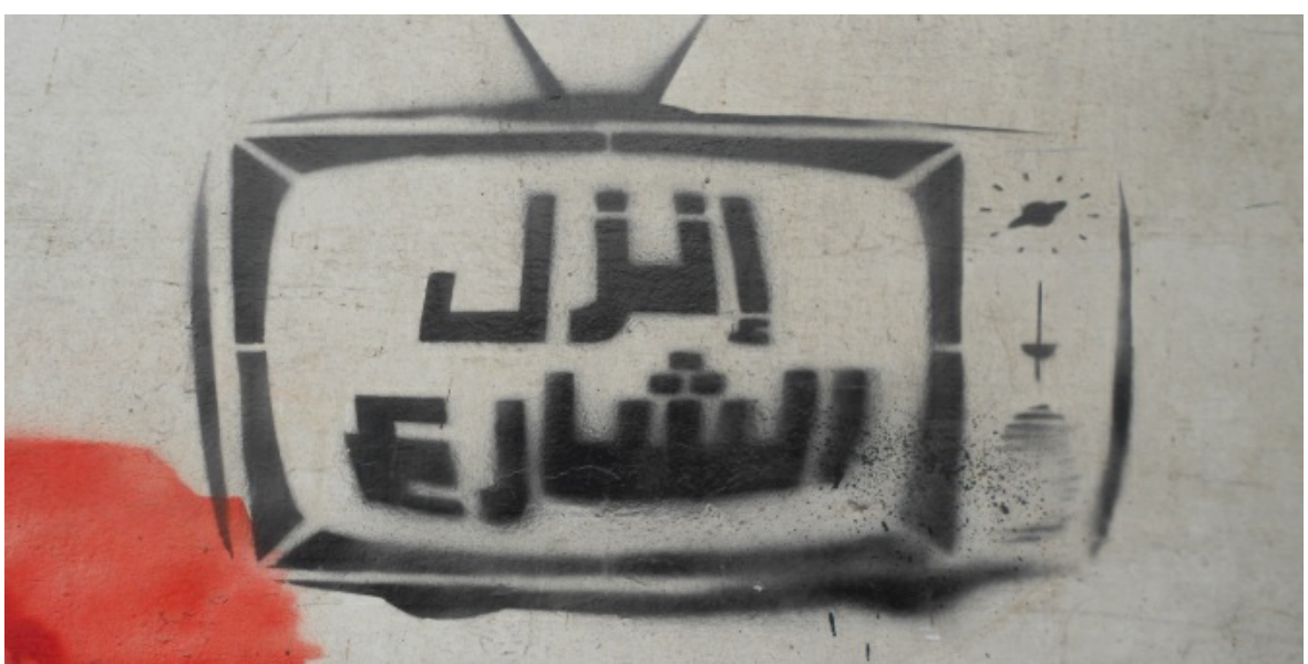
Graffiti, Cairo, Tahrir Square, November 2011

In the book, El-Issawi makes two key points. Firstly, journalistic practice continues to be shaped by political context. Whereas at the start of the transitions journalists adopted the position of activists and advocates for change, the relationship between the media and the political sphere sees them end up as political puppets and messengers. Secondly, in part as a result of the first point, we now see the emergence of a hybrid form where the journalist embodies 'a mix of authoritarian and pluralistic practices' (64). Journalistic practice is therefore shifting between the position of advocate, lobbyist and informer, amongst many roles. These points are integral to any worthwhile debates on media professionalism and independence, and El-Issawi supports her claims with empirical evidence and media content examples.