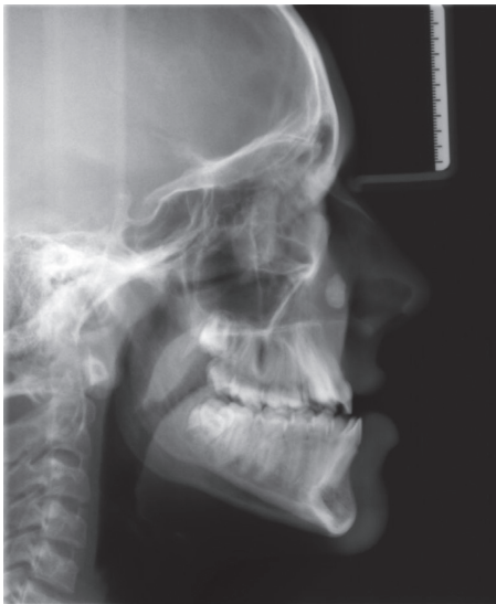
FIGURE 2: Lateral cephalometric radiograph taken prior to orthodontic treatment showing a calcified mass above the apex of the upper right canine.