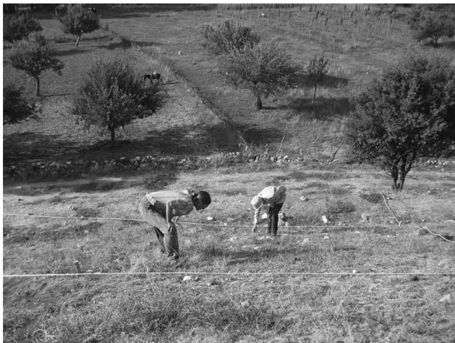
Figure 5.3: Intensive collection survey.

The volume of material from any given square was largely determined by recent post-deposition activities, as suggested by a secondary study conducted in 2009, in which two ten by ten meter areas walked in 2008 were re-walked, and individual finds were plotted using a total station. One area had been subject to plowing, and the other not but had evidence of extensive mole activity (which is common at the site). The number of artifacts in each was similar to the quantity collected from each the previous year, and their respective distribution accorded with the method by which