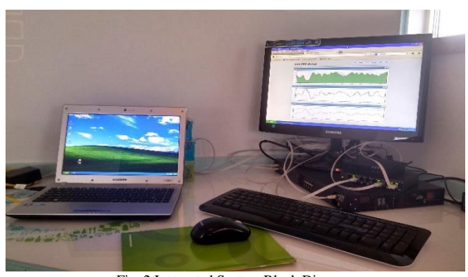
Fig. 2 Integrated System Block Diagram Photograph 1 LVDC Network and Appliances

mobile PC's, screens, MFD printing and an industrial PLC unit.