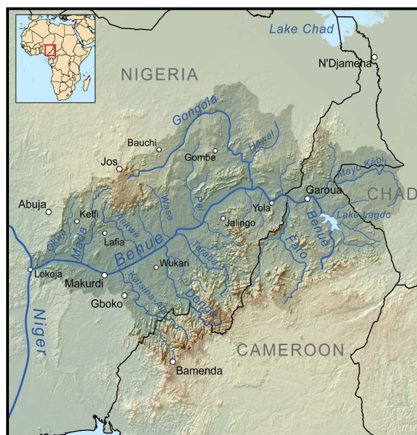
Figure 2. Map of Cameroon showing Garoua town, River Benue, The drainage, Lagdo Dam and Relief.

The case study site, Garoua, is the economic and administrative capital of the North Region, and the most densely populated town in Cameroon (see Figure 2 ) [20]. Garoua is host to several industries and agricultural parastatals that in