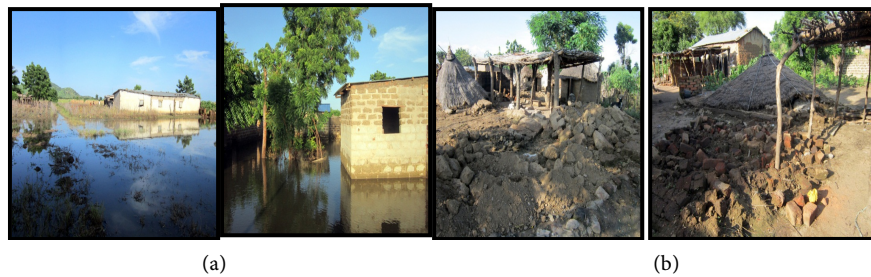
Figure 2. (a) Houses built on flood plains in Garoua; (b) Source: Collapse mud houses following floods in Garoua in 2012.

houses have been built with mud and sticks that easily collapse when flooded (see Figure 2(b) ). Consequently, the houses are easily flooded even with low water-level rises after heavy rains. The inability to live in a safe area, and construct resilient houses, is directly linked to poverty and limited access to resources [8].