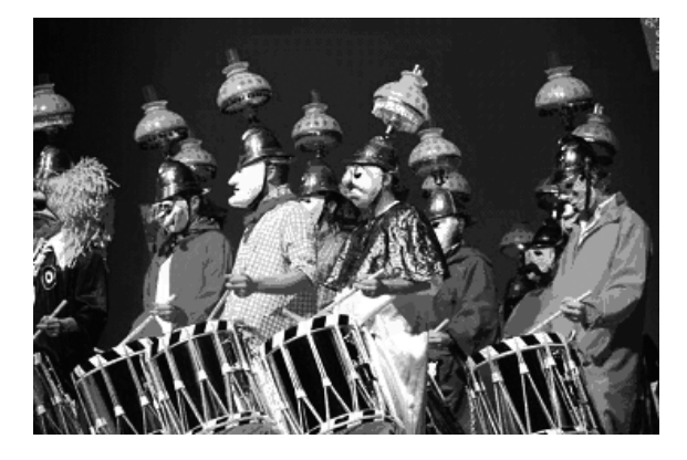
Anticipation filled the auditorium as the stately tones of a surrealistic carnival band announced the opening of the 15th WONCA Europe Conference.