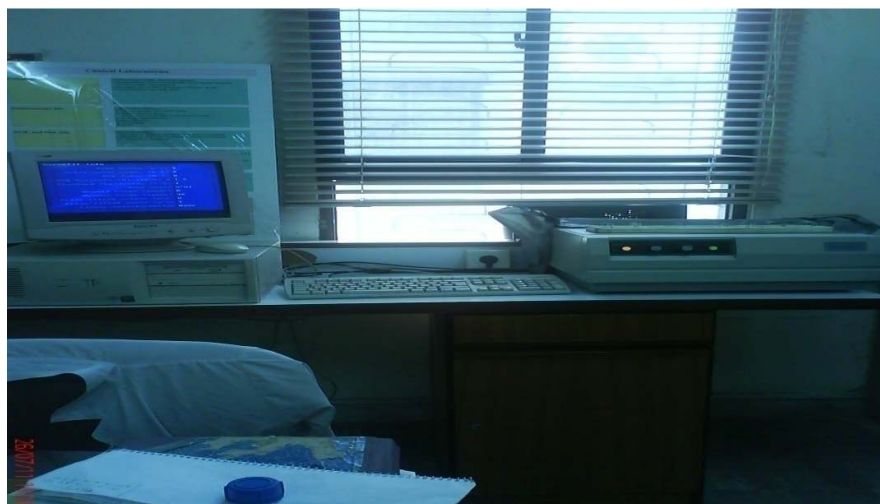
Fig. 1C. Gamma Counter with coputerized system for the assay analysis of CA15-3. With the permission of KIRAN hospital, karachi