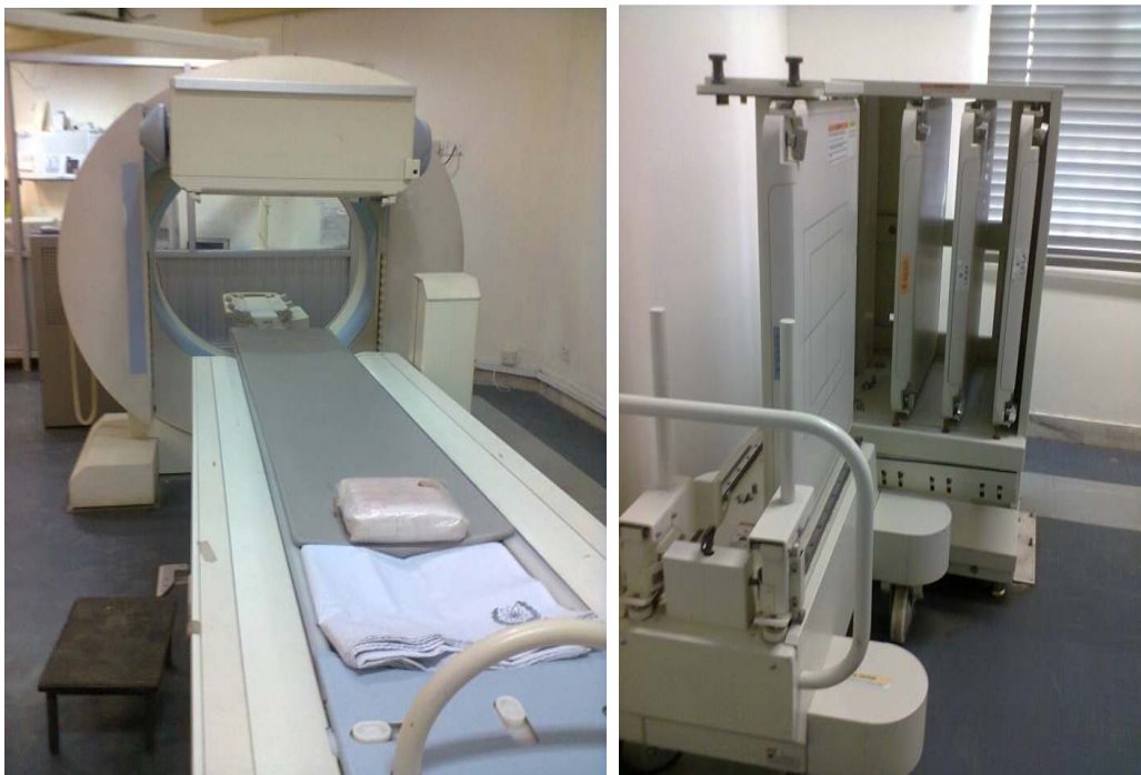
Fig. 1A & B. Siemens E Cam Bone Scan Machine

Serum levels of ca15-3 were measured with the help of Gama Counter (Fig. 1C) with computerized system and IRMA kit (Immunoradiometric Assay) by IMMUNOTECH, REF, and IRMA 2397. We collected the serum in simple tubes and stored at <-18 degree centigrade. First diluted the samples and control by adding 10/ul of samples or control in to glass tubes and then adding to each tube 500/ul of diluents and then shaken gently before use. To coated tubes we added 200/ul of calibrator, of diluted sample or of diluted control then incubated for two hrs at 18- 25 degree centigrade with shaking at 400 rpm. Then aspirated the content of each tube, then washed twice with 2/ml of distilled water. After that we carefully aspirated. After aspiration we added 200/ul of tracer in each tube, incubated for 1 hr at 18-25 /degree centigrade with shaking at 400 rpm. For counting the bind antigen antibody, aspirated the content of each tube, then washed twice with 2/ml of distilled water. Then counted for 1 minute both bound B cpm and total cpm. We also added the 200/ul of tracer in 2 additional tubes to obtain total cpm.