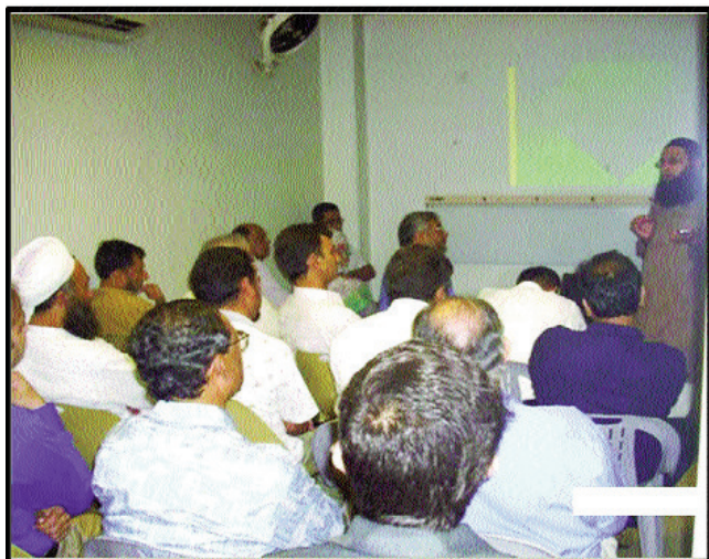
Figure-1: First meeting of city tumour board held on Sunday March 28, 2010.