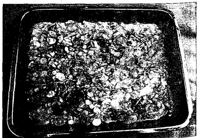
Figure 2: More than 1000 hydatid cysts were removed.