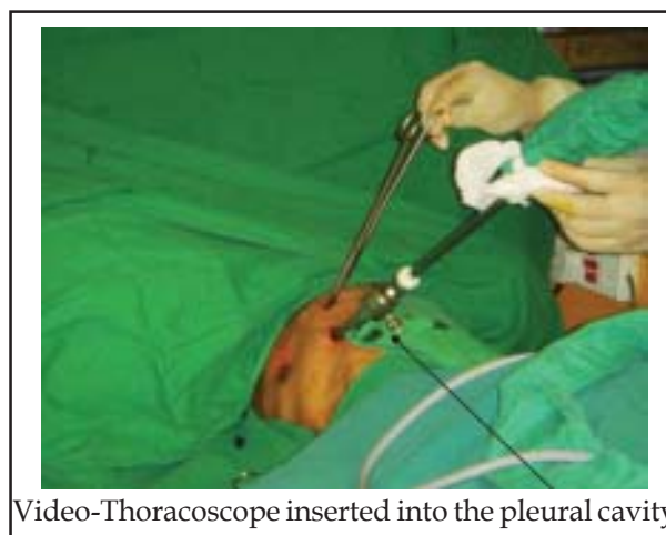
Fig-2: Video-assisted Thoracoscopy (VATS)

Looking at the monitor, the targeted nodal station in the mediastinum is approached. The parietal pleura is lifted up using a grasper and cauterized with care so as not to injure the superior vena cava, phrenic nerve, aorta or pulmonary artery. The nodes are mobilized with blunt dissection via endo forceps and then multiple biopsies are taken under direct visualization on the TV monitor. The same principles are followed for nodal biopsies in the