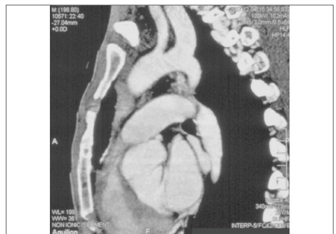
Figure 1: CT scan showing the atretic aortic isthmus.

Patient tolerated the procedure well. No significant pressure difference or radio-femoral delay was noted post-operatively. Postoperative course remained unremarkable.