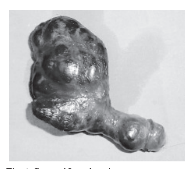
Fig.-2: Resected Lymphangioma.