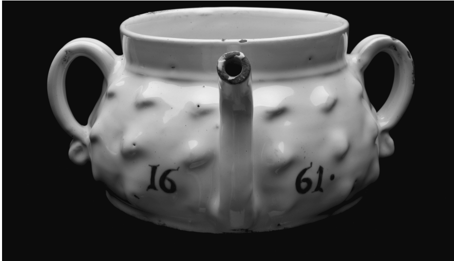
Figure 3. Posset cup, 1650–1700; Science Museum, Wellcome Images, reference: L0057146 (CC BY 4.0). Posset was a thick liquid food, commonly taken by convalescents and other ‘weak stomached’ patients; typically it was made from warm milk, curdled with ale/wine, and flavoured with sugar and spices. This pot is decorated with raised bumps, a technique known as repoussé. The bumpy texture, together with the handles, may have helped the weak convalescent to grip the pot; the spout facilitated drinking.

Another important consideration was liking. At the beginning of convalescence, it was vital to indulge the patient’s dietary predilections. The Manchester physician Thomas Cogan (c.1545–1607) provided a justification in his regimen for sickly students: