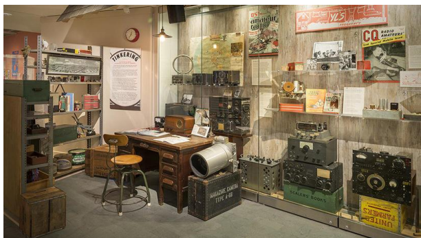
Figure1. Historic Scientific Instruments at Harvard University (Department of the History of Science website 2017)

In their seminal CHI paper 'Tangible Bits: Towards Seamless Interfaces between People, Bits and Atoms' of 1997, the authors, Hiroshi Ishii and Brygg Ullmer, inspired by the collection of the historic scientific instruments at Harvard University conclude that: "users of the past must have developed rich languages and cultures that valued real haptic interaction with real physical objects". (Ishii, Ullmer, 1997).