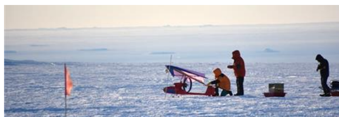
Figure 1. Photo just before "Take off" of Kite Plane at S17

The campaign using Kite Planes at S17 was succesfully performed and obtained interesting dataset for distribution of aerosol number concentration, condensation nuclei concentration, aerosol constituent, and meteorological data. We will show detailes of results on transportation and nucleation of aerosol around S17 and Totsuki in January 2017.