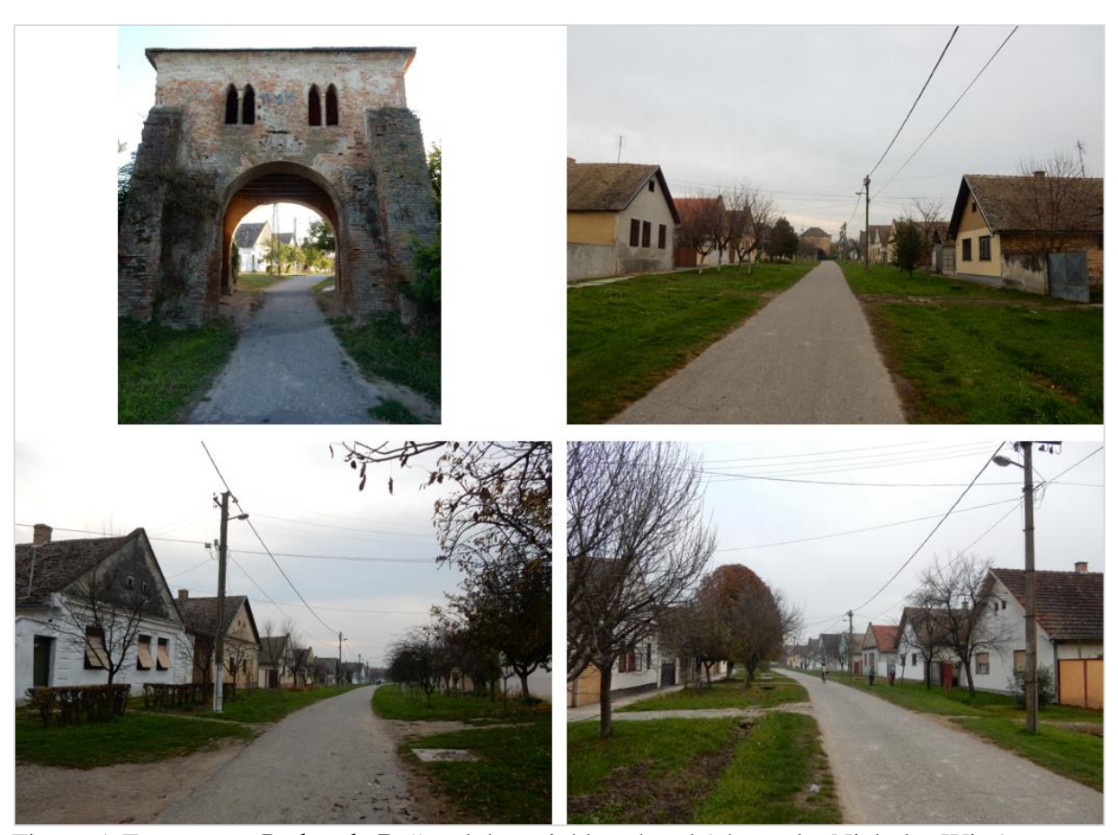
Figure 5. Entrance to Podgrađe Bač and the neighbourhood.