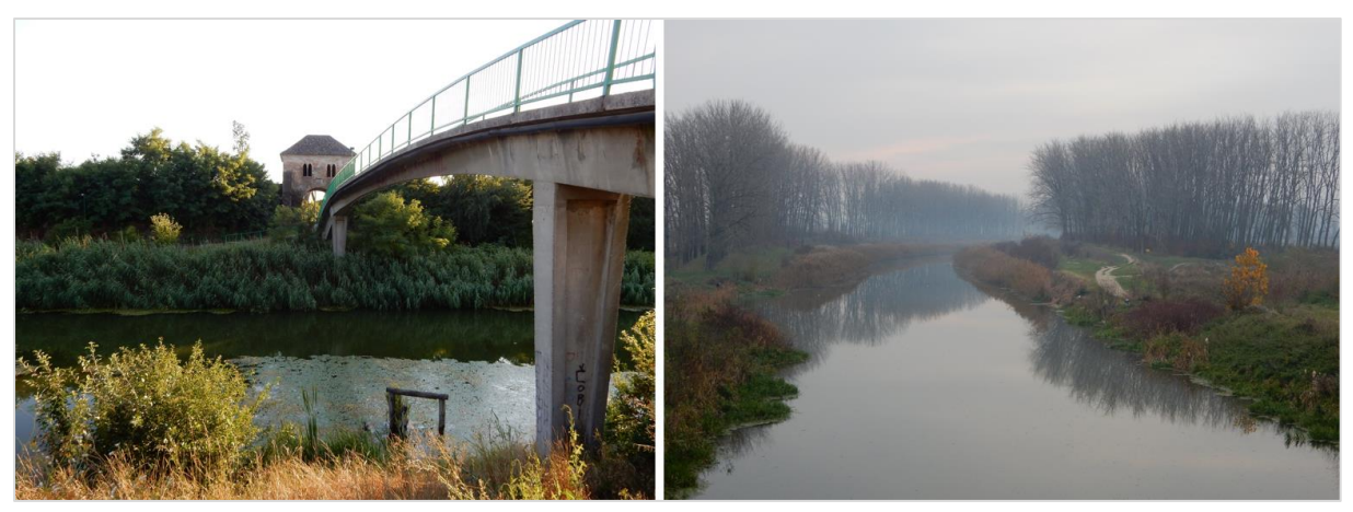
Figure 6. Bridge over the canal to the entranceway to Podgrađe Bač. There are plans to build a visitor centre close to the pedestrian/biking bridge to the neighbourhood entrance to direct tourists to the fortress who are traveling along the canal path.