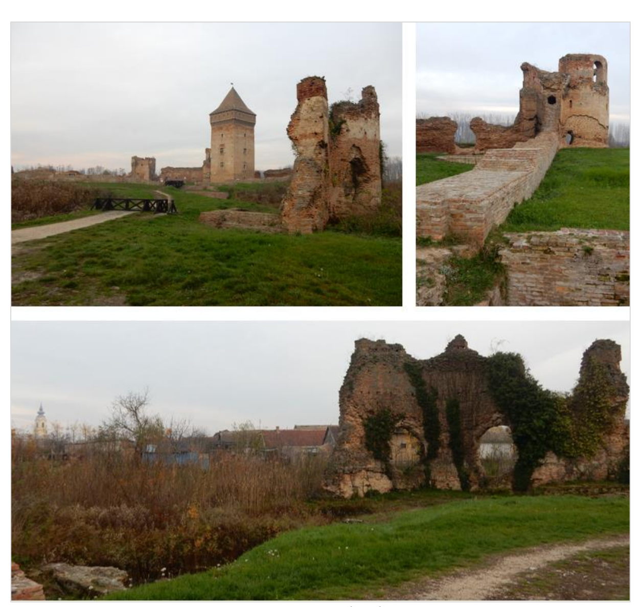
Figure 4. Images of the Bač Fortress adjacent to Podgrađe Bač.