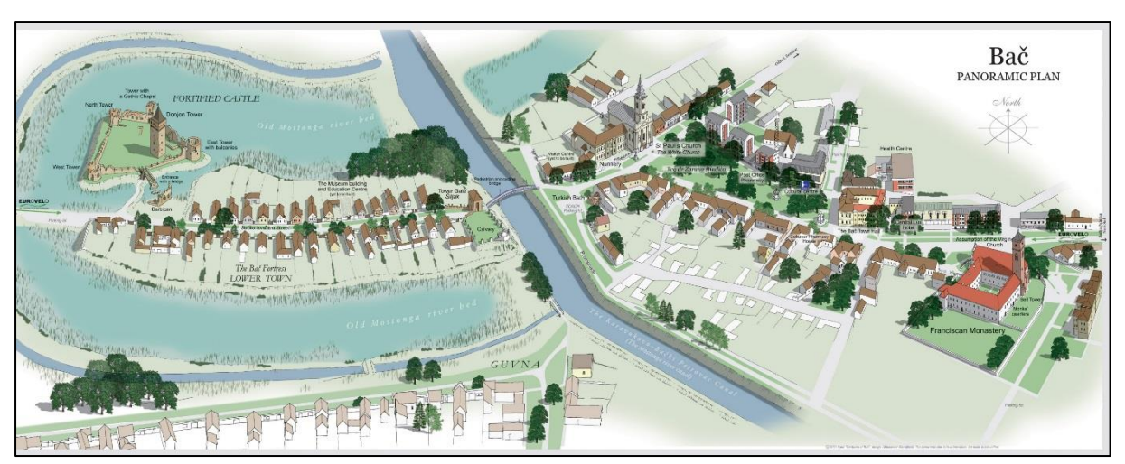
Figure 2. Case study of 35 homes in Podgrađe Bač neighbourhood and the location of the Bač Fortress