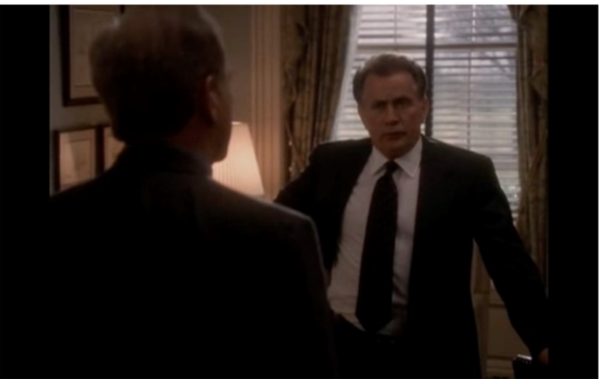
Sequence 4. Leo and the President are standing in the President's office