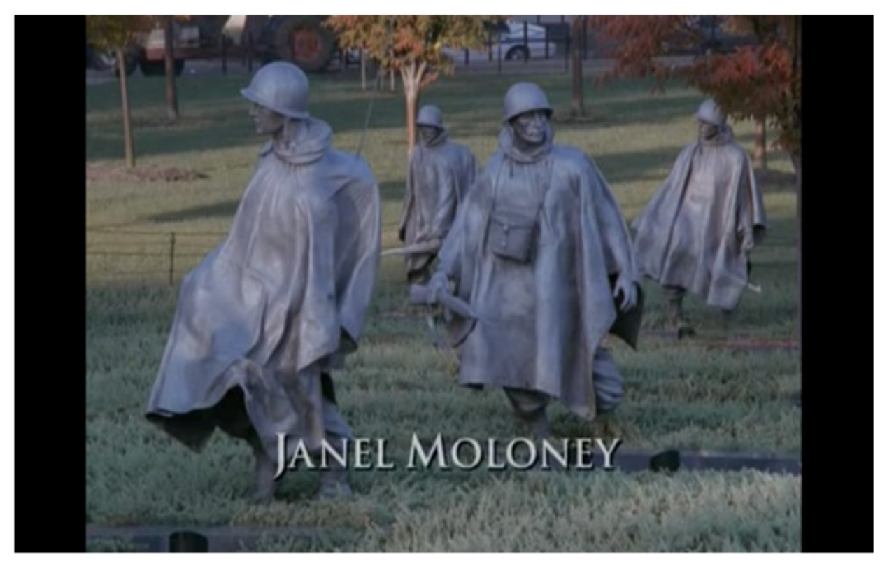
Sequence 9. Opening credits for this episode

Issues such as when to read, how many to read, and how to read the credits are important considerations. There are many options: Read all, read some, or a selection of the credits. They can be read all together at the beginning (Orero 2011), or synchronised with when each character is presented. The choice will be settled as the style for the whole series. Special attention should be paid to the overall effect of mixing AD with the name of characters, to avoid cohesion problems (Braun 2007, 2008, and 2011, Taylor 2004). Audio description of credits should be decided for each product, since in some cases it is possible to read the titles synchronically, while in other cases it may produce confusion. An example will be the synchronic audio description of the first frame in Sequence 9: "Paul Austin: a man pushes a wheelchair". This may lead to believe that Paul Austin is the man pushing the wheelchair.