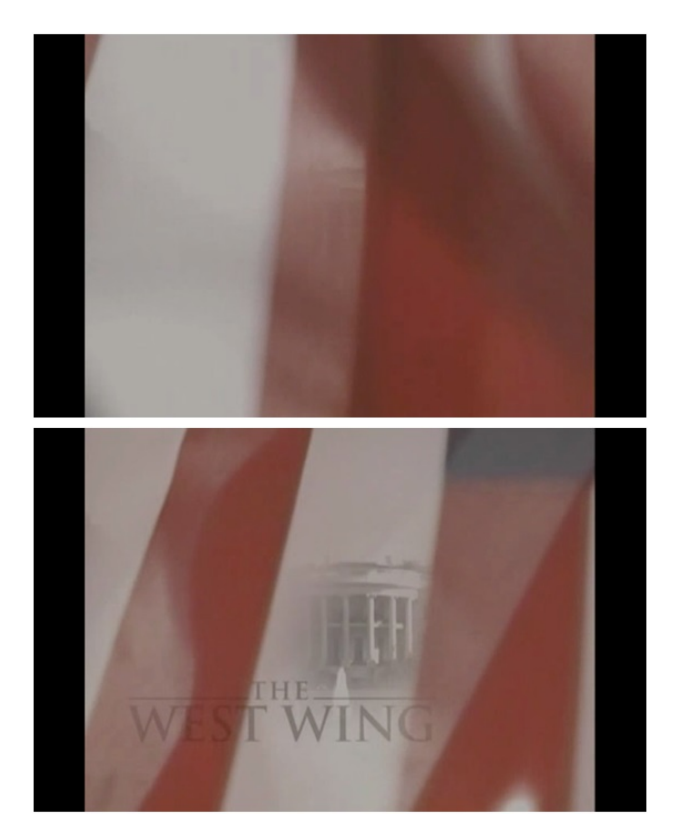
Sequence 1. Three frames from the opening credits in sequential order

Since this opening is common to all the episodes, it should have a standard AD formula which is repeated for each episode. During this short sequence the theme music can be heard, allowing for audio description to be read on top of the music.