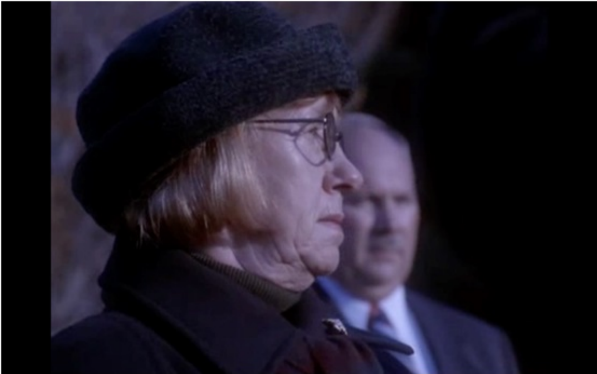
Frames 5 & 6. Toby and Mrs Landingham are shaken by the shooting

Hence it is important to describe the sound before it can be heard in order to offer a context and an explanation. The shooting breaks the existing running sound, which is the peaceful and harmonic carol, with the resulting effect acting as a shattering contrast.