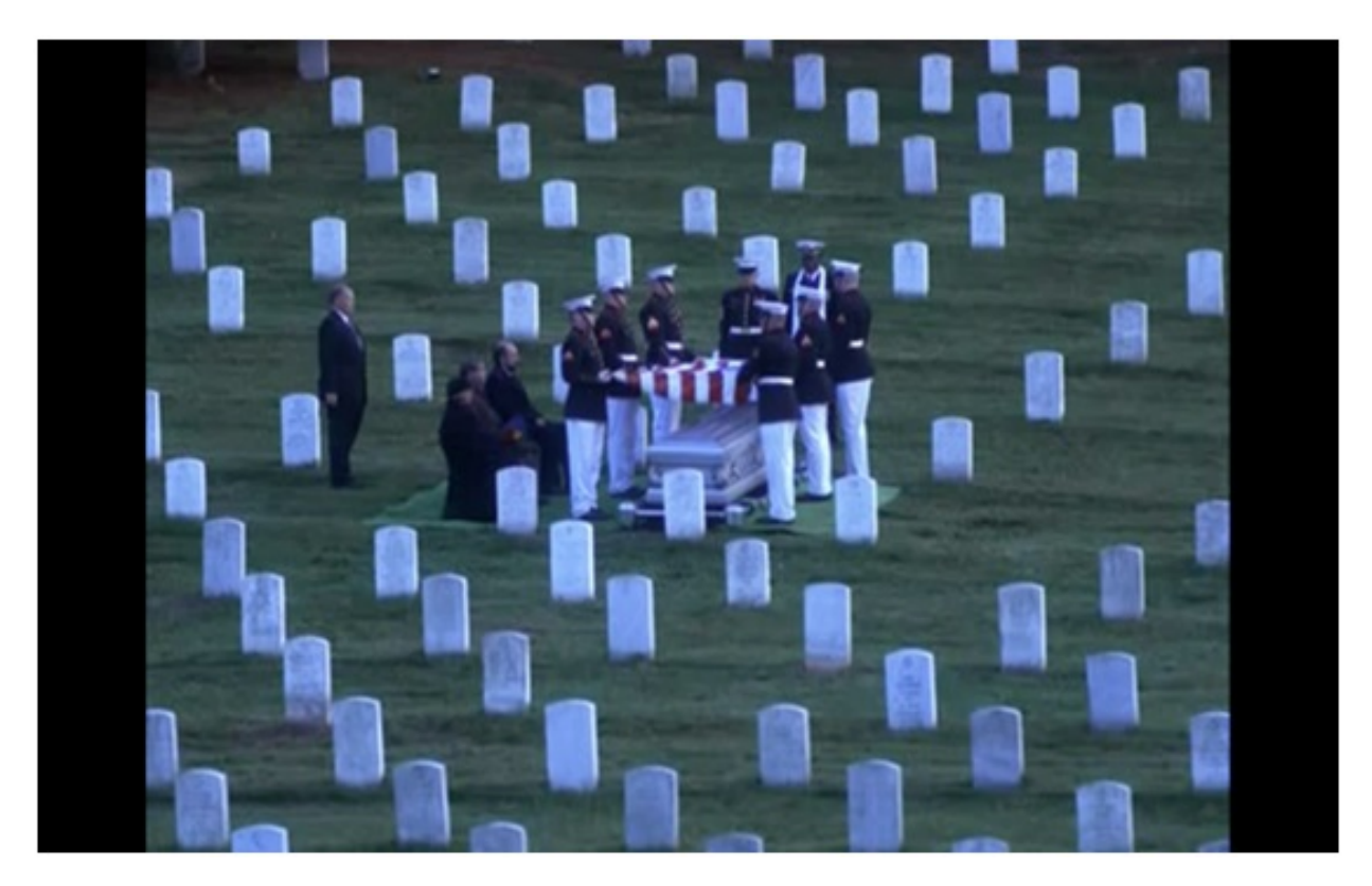
Sequence 12. Burial protocol at Arlington cemetery

While reading visual narrative is acceptable in audio description beyond mere description, we can for this series rely in the information regarding emotions and facial gestures offered in the dialogue list.