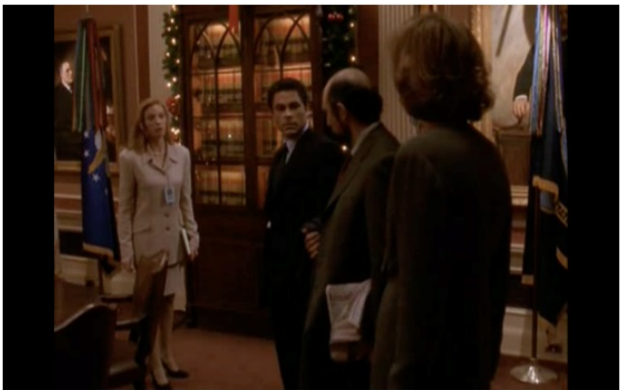
Sequence 7. WestWing main characters in the Christmas decorated set

The re-cap provides the context for the episode within the rest of the series, and also the specific theme for the episode [i.e. Christmas].