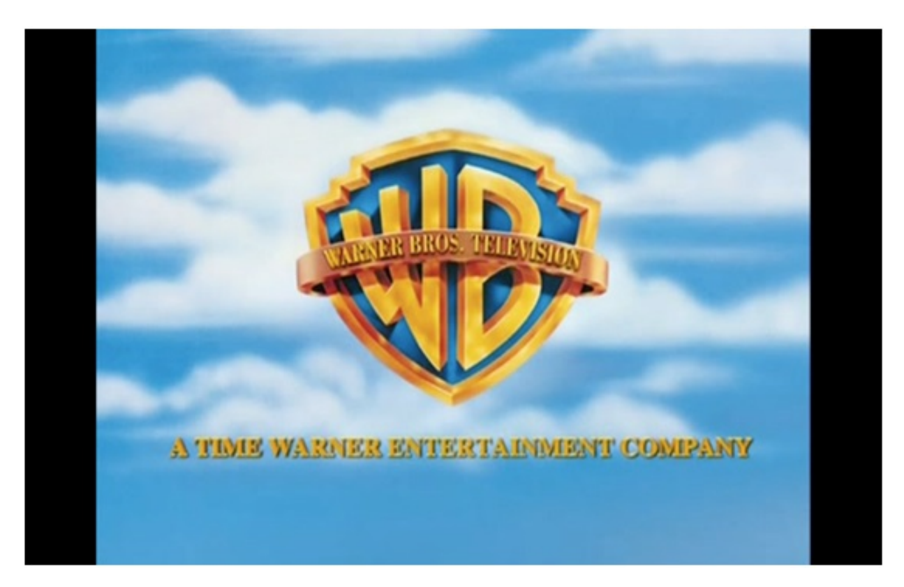
Frames 8, 9 & 10. Final credits