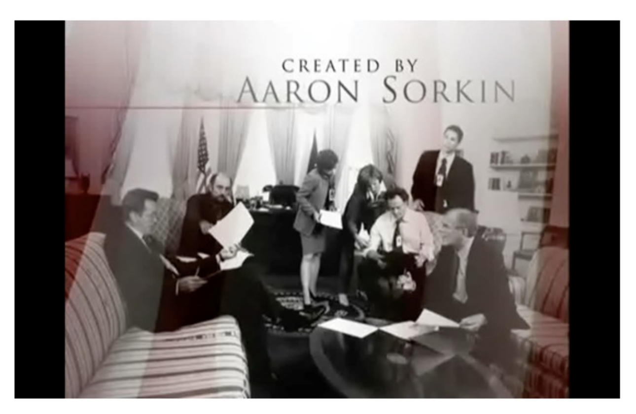
Sequence 8. Opening credits for the series

This is followed by the rest of the credits rolling - five guests invited for this episode, the name of the creator, music composer, co-producer, and producer – which are shown over opening scenes; images of the Arlington Cemetery, one of the main plot locations of the episode.