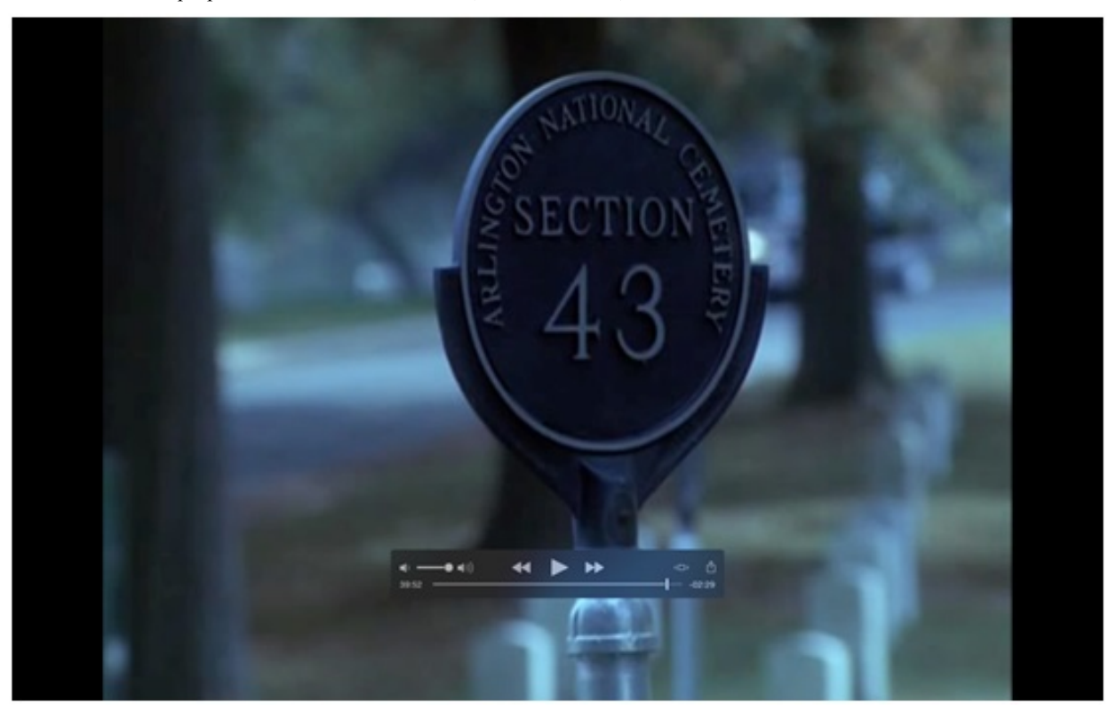
Image 1. Image indicating precise location where action takes place

In some instances, such as the final scene at the cemetery in Image 1, there is the following object which should be considered for AD purposes as written information, and read aloud, as the case with intertitles in section 3.2.