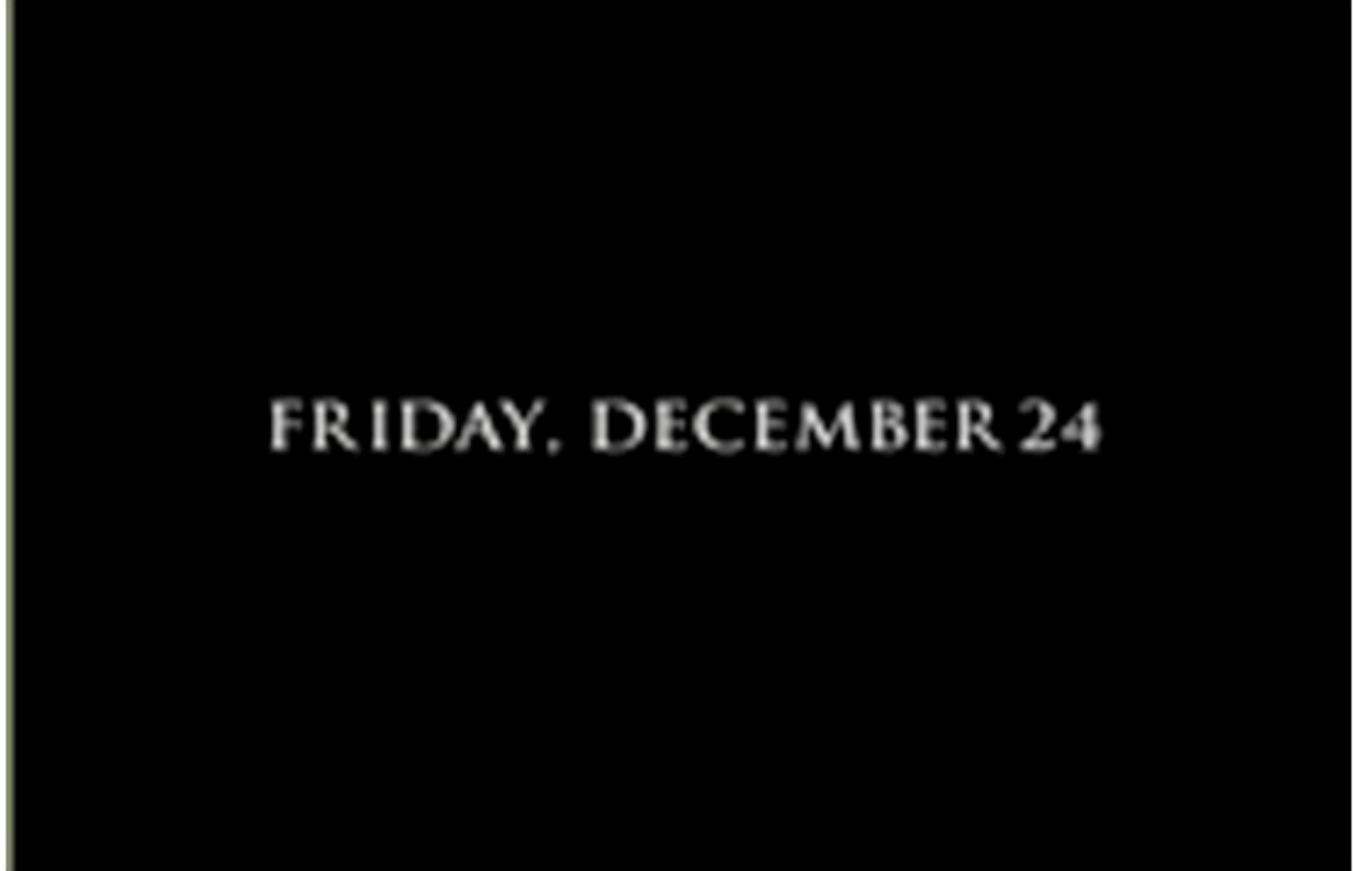
Sequence 10. Intertitles indicating the day when action takes place.

During the two days marked by the intertitles, the action is developed in linear time. We begin in the morning on Thursday 23rd and the action has a logical development all the way to the last scene on Friday 24th December when Toby is at the cemetery and misses the Christmas singing by the tree with his work colleagues.