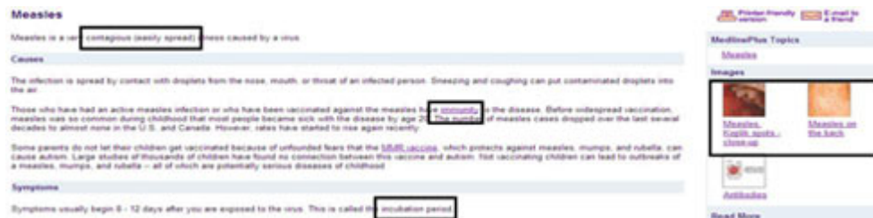
Figure 4. Definitions provided to address the lay audience in Medline encyclopaedia.

In the first case, the use of parenthesis (“...contagious (easily spread)...”) leads the user to skim through the information, unless there is a need to pay attention to the definition. In the second case, a hyperlink provides a new entry in the encyclopaedia (“immunity”), through a hyperlink that constitutes a traditional user-activated format in the web. In the third case, the definition is provided before the actual term, “incubation period”, and connected with it cohesively. All three forms of definitions provide information to the lay audience that typically uses this web. From an interlinguistic perspective, the previous knowledge of the target audience may be different to that assumed for the audience of the source text, thus demanding a change in the level of expertise determined in the definitions. This is particularly common in the translation of Greek or Latin root terms and definitions in the EN-ES language combination, where there is often common world knowledge of Greek or Latin root terms in Spanish lay audiences (eg. amigdalitis , cefalea , etc).