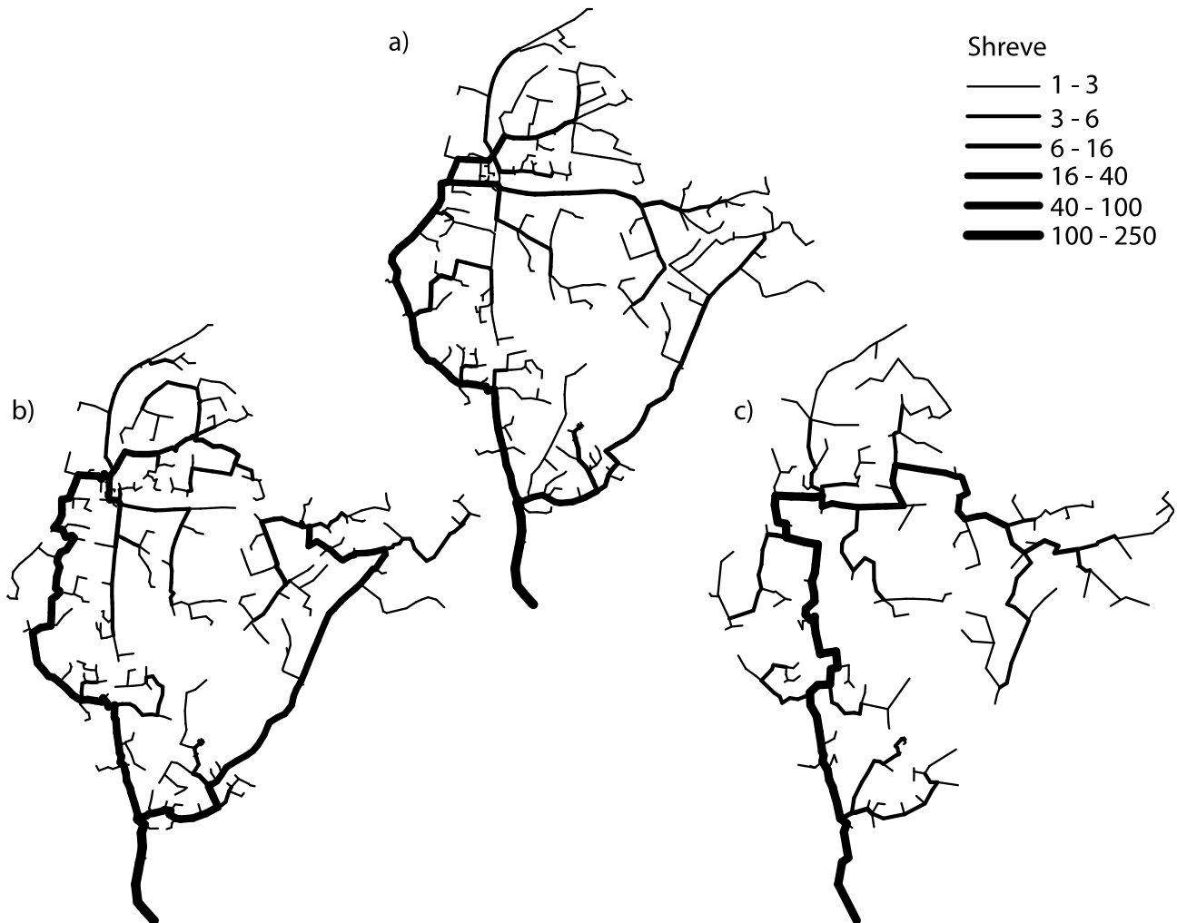
Fig. 1 Comparison between the actual and reconstructed networks using cost function 1 and \alpha=0.9 , \beta=2 and \gamma=5 . a) The actual network; b) The reconstructed network using the entire dataset; c) The reconstructed network using half of the manhole cover locations.

The actual and reconstructed networks (with all and half of the nodes) using the first cost function are presented in Fig.1. The best results are obtained for \alpha \geq 0.7 . This means that distance weights more heavily than elevation when formulated as in Eq.1. When the entire data set is used, the reconstructed and actual networks have similar Shreve stream magnitudes (131 and 125 resp. at the outlet). Based on Heipke et al., (1997), Correctness = 0.89; Completeness = 0.84 and Quality = 0.76 (Tab. 1). These values drop to 0.44, 0.55 and 0.32 respectively when using only half of the nodes and the Shreve stream magnitude at the outlet drops to 84.