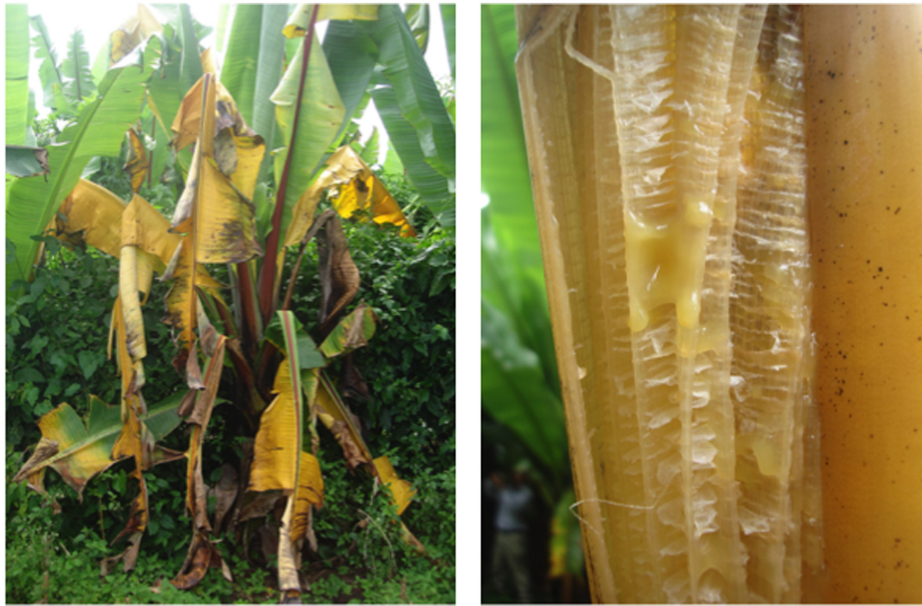
FIGURE 3 | Xanthomonas bacterial wilt of enset caused by X. campestris pv. musacearum . The photos depict leaf yellowing and wilting, and pockets of bacterial ooze in a leaf petiole.

by bacterial wilts reduces water flow is not completely clear. There is no evidence for excessive transpiration linked to loss of stomatal control as could possibly result from a systemic toxin (Buddenhagen and Kelman, 1964; Van Alfen, 1989). The primary factor is most likely plugging of pit membranes in the petioles and leaves by a high molecular mass extracellular polysaccharide (Van Alfen, 1989), but high bacterial cell densities, plant-produced tyloses and gums, and byproducts of plant cell wall degradation may be contributing factors (Denny, 2006).