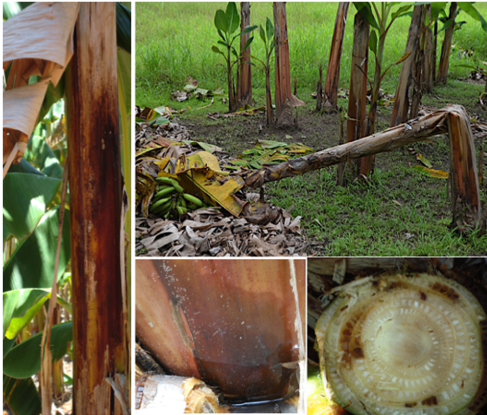
FIGURE 6 | Erwinia -associated diseases (bacterial head rot or tip-over disease caused by Erwinia carotovora ssp. Carotovora and E. chrysanthemi, bacterial rhizome and pseudostem wet rot ( Dickeya paradisiaca formerly E. chrysanthemi pv. paradisiaca). The photos depict pseudostem symptoms and pseudostem doubling.