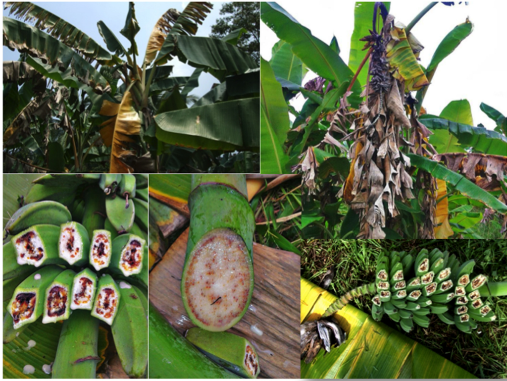
FIGURE 5 | Banana blood disease caused by R. syzygii subsp. celebensis . The photos depict leaf yellowing and wilting, and fruit pulp and bunch stalk/rachis discoloration. Photos were taken in Malaysia by Agustin Molina.

entire plant, and suckers will also wilt and die (Eden-Green and Seal, 1993; Eden-Green, 1994b; Supriadi, 2005). R. syzygii subsp. celebesensis strains causing banana blood disease is strictly related to banana (and some Heliconia ) and not to Solanaceae hosts, unlike R. solanacearum strains causing Moko/Bugtok disease.