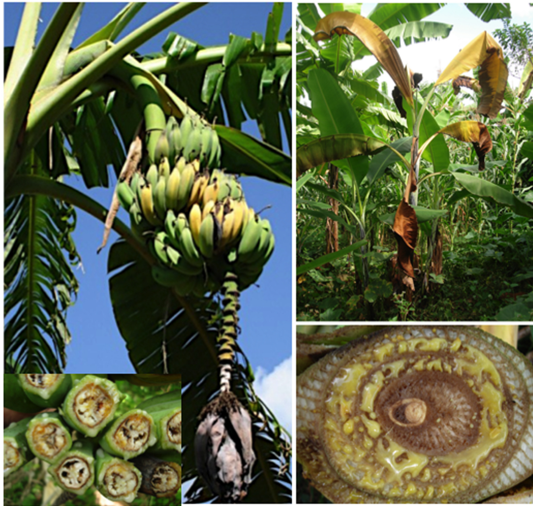
FIGURE 2 | Xanthomonas bacterial wilt of banana caused by X. campestris pv. musacearum . The photos depict leaf yellowing and wilting, exudation of bacterial ooze, premature fruit ripening and fruit discoloration. Photos were taken in Uganda by Guy Blomme.

strains of the disease were already present on solanaceous and other crops, including Musa textilis in 1969 (Zehr, 1970; Eden-Green, 1994a; Seal and Elphinstone, 1994; Taghavi et al., 1996). A first report of R. solanacearum causing Moko disease of banana in Malaysia was published by Zulperi and Sijam (2014). Reports of the occurrence of banana bacterial wilt in Cambodia and India have not been confirmed (Jones, 2000; Daniells, 2011). An outbreak of R. solanacearum on ornamental Heliconia spp. in Australia was eradicated (Jones, 2000).