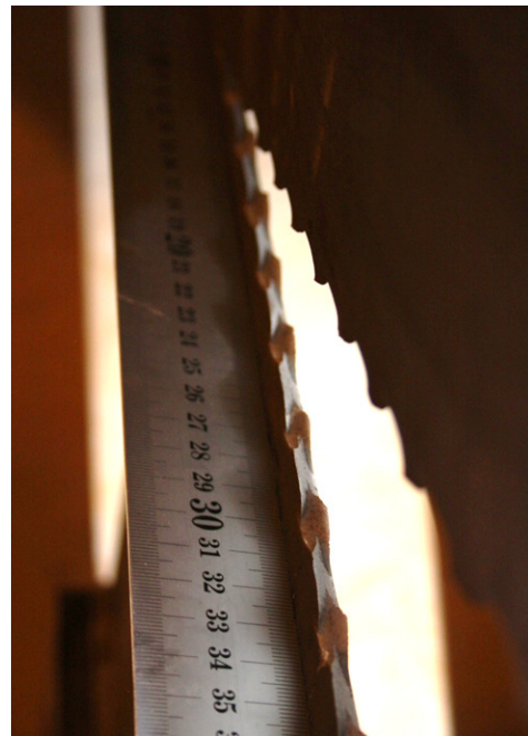
Figure 1: Repeated crack tip flipping in large scale testing of a normal strength steel plate subject to mode I loading.

Strong evidence exists that a number of unexplained transitions in crack surface morphology, that appears in mode I tearing of ductile plates, can be assigned to the so-called “crack tip flipping” mechanism, or element here of. But, little effort has been devoted to getting to the bottom of this intriguing plate tearing phenomenon despite numerous researchers reporting it. Crack tip flipping reveals itself when a slanted tearing crack, propagating in a ductile plate, shifts its orientation from one 45-degree angle shear band to the other. That is, the mechanics at play during crack tip flipping is strongly tied to the well-known slant crack propagation, where two equally active shear bands travel ahead of the leading tip, within a heavily strained region, such that plastic flow and damage evolution localize in one shear band and leaves the other band inactive. Figure 1 display a mode I crack that repeatedly flips back and forth in a very periodic manner and with high frequency – leaving a “shark teeth”-like surface. The flipping frequency is, however, dependent on the set-up (the constraints), the plate thickness, and plate material. For example, El-Naaman and Nielsen (2013) reports high frequencies for steel, whereas the same tests performed on aluminum shows a lower flipping frequency. In fact, a slant crack can display flipping spaced apart on the fracture surface such that the