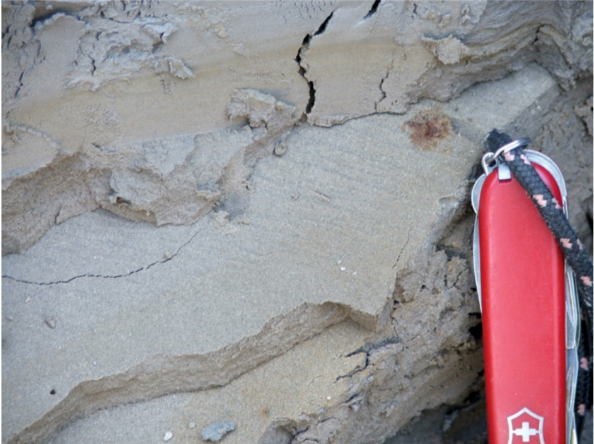
Figure 48. Possible primary current lineation on the bedding plane of an interbed of fine-grained sand within the Ardersier Silts Fm.

The exposed sequence comprises typically up to c. 1.5 m of compact, dark grey, sandy and clayey, thinly bedded to thickly laminated silt (Fig. 47 A). The silt contains thin discontinuous interbeds and partings of fine sand, some of which show fine horizontal lamination; traces of small-scale ripple lamination are also present. Possible primary current lineation (NNW-SSE) are present on the upper bedding planes of some of the thicker (2-3 cm thick) sand interbeds (Fig. 48). The silts are weathered to olive grey to a depth of c. 0.6 m beneath the top of the cliff.