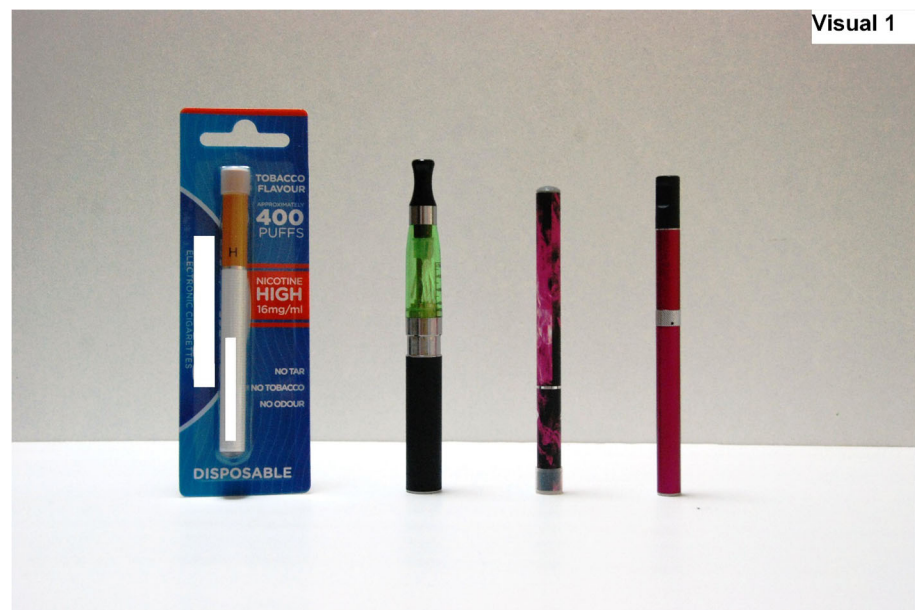
Fig. 1 Visual prompt used in the survey to illustrate different styles of e-cigarettes

Research between April and July 2014 informed the development and refinement of the e-cigarette measures. Initially, six focus groups were conducted with 11–16 year olds to explore their knowledge of e-cigarettes, how they think about and respond to them, and the language and meanings they attach to them. A draft questionnaire was developed from the emerging themes using, as far as possible, the terms the young people used. This was piloted with 11 participants aged 11–16 years. Two professional market research interviewers were involved in administering the pilot questionnaire. Each interview was observed by a member of the research team, to test the flow of the questionnaire, timing, and comprehension of questions and visual stimuli. On completion of the questionnaire, the interviewer left the room and the researcher conducted an in-depth cognitive interview to assess participant understanding of the measures, relevance of questions and ability to respond.