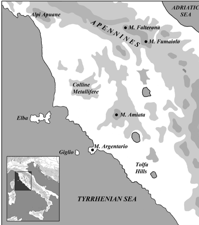
Fig. 69.1: Altitude and mountains in Etruria (drawing A. Blackner).