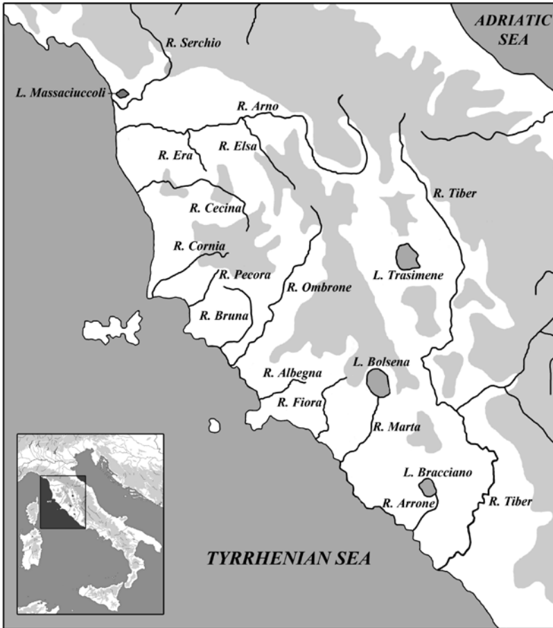
Fig. 69.2: Drainage basins in Etruria (drawing A. Blaickner).

can bank of the river, a series of small rivers drains from the extinct volcanoes cutting across the tufo plateaus either into the Tiber to the east or into the sea. The largest of these, the Arrone River, flows from the caldera lake of Bracciano to the sea between the mouth of the Tiber and Caere. Farther north, the Marta River drains the lake of Bolsena, which is otherwise enclosed by the volcanic crater rim of the Volsini Mountains, into the sea near Tarquinia. Northeast of the lake, near Orvieto, the Paglia River, the largest tributary of the Tiber, flows from the slopes of Monte Amiata in the center of Etruria to join the Tiber. The Paglia Valley rapidly narrows as the terrain becomes more mountainous. The Tiber itself flows from the east, cutting down from its wide valley in the folds of the Apennines which cross Umbria from northwest to southeast (Fig. 69.3).