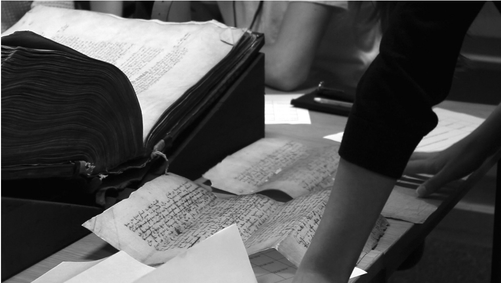
Figure 1: Facsimile of PROB 1/4 being compared to the registered will in PROB 11/127/771.

present – as actual documents, as microfilms, as digital images, and in this case as a cultural icon mediated through these different interfaces. The other film set Shakespeare's will alongside the wills of the four other men proved in court on the same day, 22 June 1616. 8 Although four of these wills were completely accessible as physical documents, the fifth – Shakespeare's – clearly was not. As Shakespeare's will is one of the treasures of The National Archives, it cannot actually be handled, let alone refolded or treated over-familiarly. Our film-maker dealt with this by making a prop – recreating the original will in facsimile (see Fig. 1), printing it off full size in colour from the TNA website, where it is freely available, 9 trimming the flat A3 edges to the rather ragged edges of the original paper, and folding it along its old fold lines. The students found the bundles of wills proved in June 1616 (see Fig. 2), and put the facsimile back in with the rest of the folded wills, just the will of one man among many, 'William Shaksper', gentleman of Stratford upon Avon, Warwickshire. 10 We read all five wills carefully, but were disappointed to find that comparing them did not really help us to understand Shakespeare's will any better: each man's personal circumstances and availability of heirs were just too different.