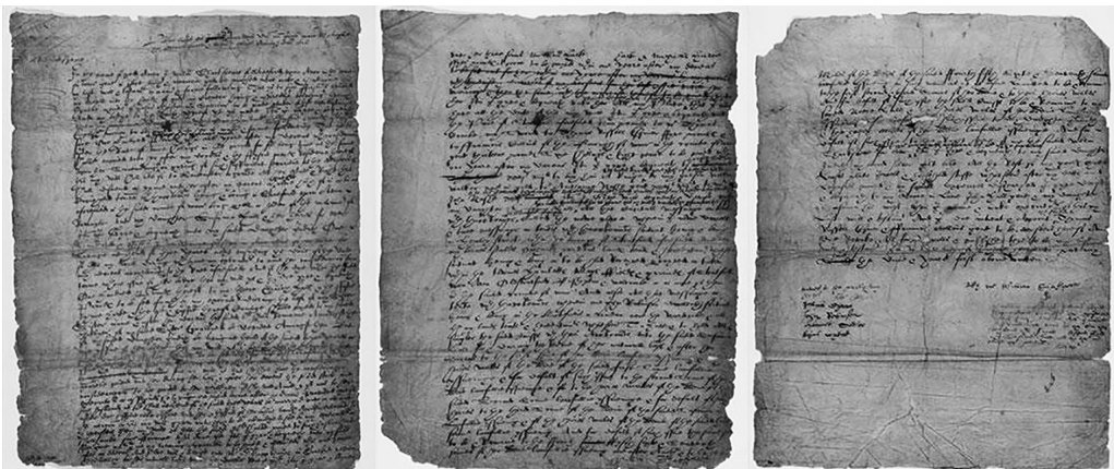
Figure 3: Shakespeare's will as seen by the human eye (470nm spectrum) – all text is visible on all three pages. The dark-ink interlineations are quite clear.

But if page 2 came from an older will, did page 3 as well? We found a clue in the bequest of all of Shakespeare's plate to Judith on the next lines [old 4] and [old 5]. This was altered by an interlineation, apparently in the same ink as the new top lines, substituting his grand-daughter Elizabeth Hall as the receiver of the plate 'except my brod silver and gilt bole'. This same bowl appears on page 3 written within the text, as a direct bequest to Judith. If Page 2 and Page 3 had been written at the same time, it is odd that such a change of mind had occurred in the time taken to write the two pages.