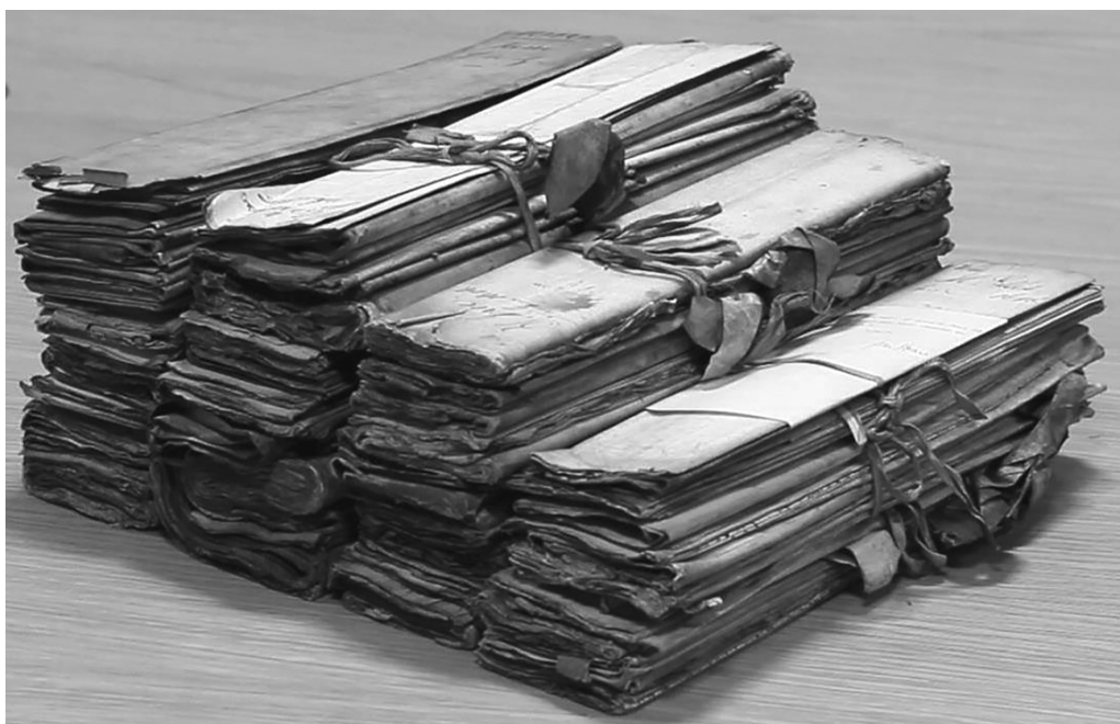
Figure 2: The bundles of original wills proved in June 1616 (TNA: PROB 10/332).

contexts sought. There was a surprising difference between having even a standard A3 copy, and the physicality of the trimmed and folded facsimile will. Previous studies have generally been based on mediated copies – maybe sepia or monochrome images, or photographs, often reduced in size, but after an initial look, most researchers have quite understandably relied on transcripts. 11 Although at least two scholars had seen the original in recent decades, they could not get deeply acquainted with it. 12 And the digital image of course provided the ability to zoom in on each word, for really close examination.