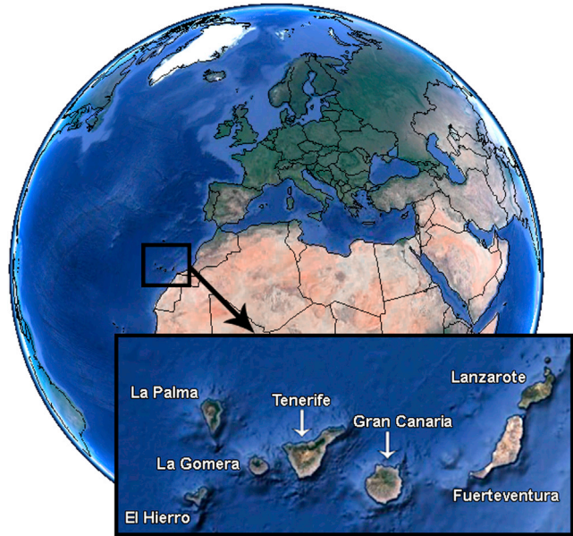
Figure 1. Map of the Canary Islands

NA, not applicable. C 14 lab numbers in order of appearance in the table: Ua-55344, Ua-55345, Ua-55346, Ua-55347, Ua-55348. See also Table S1 and Figure S1B.