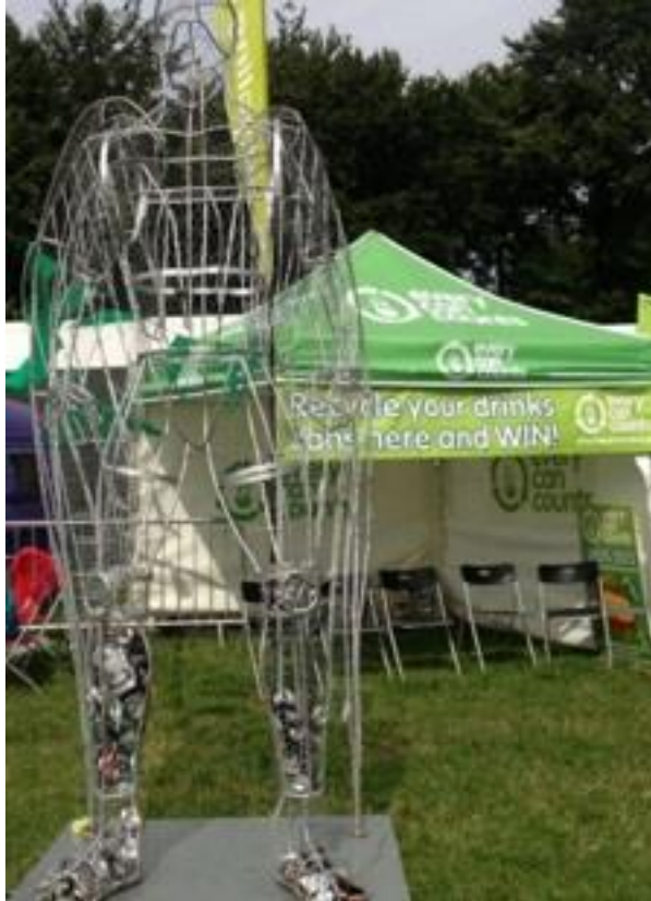
FIGURE 4 RECYCLING CANS