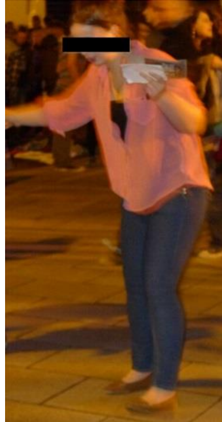
FIGURE 5 MPRE DRUNK THAN ME