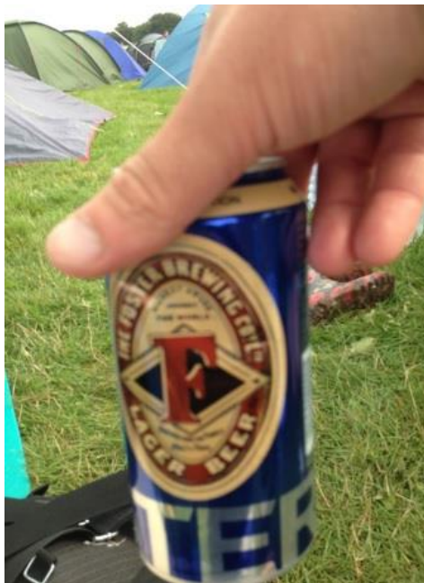
FIGURE 2 ALCOHOL UNITS ON BEER CAN