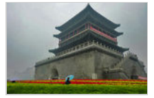
China in 1982: The country had slowly started opening up