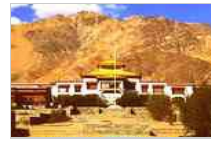
The '3 Idiots' fame Leh school to revamp maths and science education

Become a friend of your kid; so that you know with whom s/he is keeping company with.